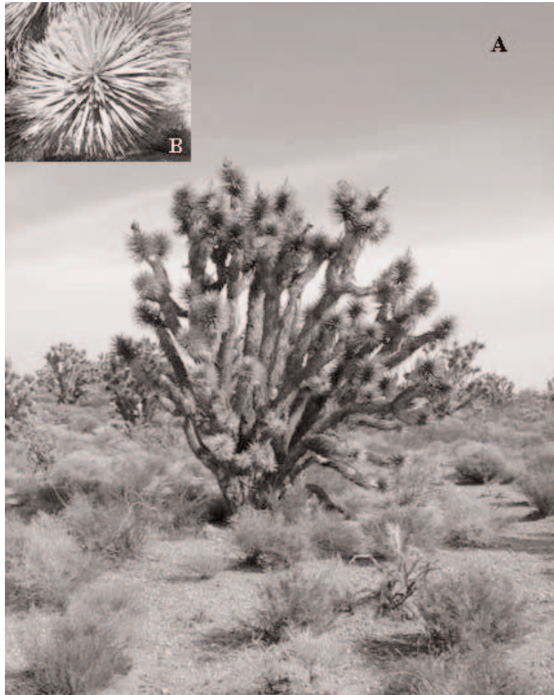
Fig. 1. A, mature Joshua tree at Lytle Preserve, Utah, with most branches oriented south; B, rosette of leaves of a Joshua tree showing herbivory by Neotoma lepida .

consume a higher proportion of leaves from south-facing rosettes, reflecting the leaves' higher nitrogen content, and that other disproportionate herbivory by woodrats would also reflect differences in nitrogen content. We tested for selective foraging between portions of individual leaves (tip vs. base), between north and south-facing rosettes within Joshua tree crowns, and among trees within Joshua tree woodland.