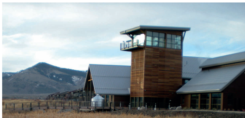
Swaner Eco-Center

USU has taken several measures to increase energy efficiency across campus. We replaced our coal-generated power plant with hydroelectric and natural gas co-generation installations, reducing emissions from 265 tons per year to less than 20 tons per year over the last five years. The new energy plant heats 1/3 of the campus by re-capturing waste heat as a by-product of electricity production. We have installed occupancy sensors for lighting in several campus locations and retrofitted 3.5 million square feet of space with new efficient fluorescent lighting,