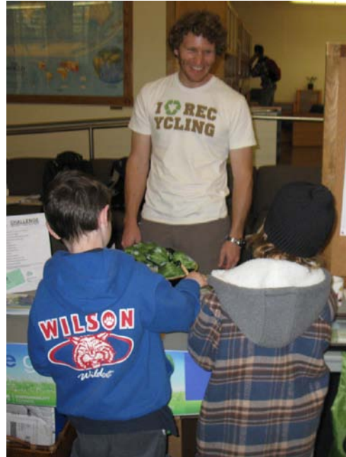
Earth Day 2010 USU Sustainability booth.