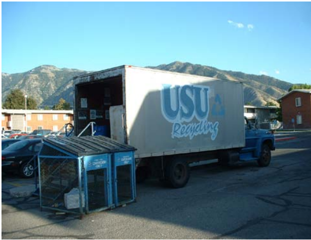
USU Recycling truck

USU's recycling program has grown from a small operation with one vehicle for retrieval in 1990, to a full-fledged Recycling Center with 10,000 square feet of space and 11 employees in 2009. Last year USU recycled over 665 tons of material in 23 different categories and expanded services to include collection of move-out goods from residence halls. The University continues to participate in RecycleMania and student organizations (such as Aggie Recyclers) have begun promoting recycling activities among their peers. Future plans call for adding recycling bins to all the offices on campus and converting to a single-stream recycling process.