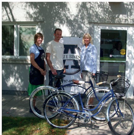
Aggie Blue Bikers from www.usu.edu/wellness-programs/sustainability

As mentioned previously, the Aggie Shuttle buses now burn natural gas rather than diesel fuel. The Aggie Blue Bikes program enables students to checkout over 200 bicycles for their own use. Over the last two years, the USU motor pool facilities operations and individual colleges have purchased more efficient vehicles including hybrids and an electric vehicle. The University revised its Vehicle Use Policy in 2010 to comply with Utah House Bill 110 "State Fleet Efficiency Requirements." The bill implements a plan to increase the fleet energy efficiency 20% by the year 2015. New vehicles purchased by any USU unit must be hybrid or alternative fueled and "right-sized" for the intended use. Any request for waivers of the Policy must be approved at the level of Dean or Vice President. The new Policy also requires annual emissions testing on all vehicles in the University's fleet or individual departments.