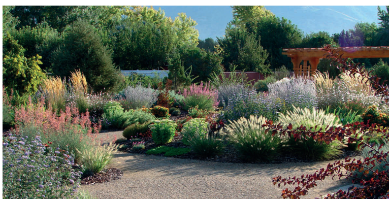
Utah Botanical Garden

The University also has instituted a program working with science departments to encourage closing of fume hood sashes in laboratories to minimum levels when hoods are inactive. We also have established a schedule for maintaining laboratory refrigeration equipment in good condition with condensing coils and having fans cleaned frequently while equipment that is deemed to be in poor condition and low efficiency is replaced. USU also conducted feasibility studies for placing a wind generator on University property and installing a second hydroelectric generation on the Logan River as additional sources of renewable electrical power generation. At present, there are no options for acquiring electrical power generated from renewable resources through the City of Logan. However, we fully expect that as wind and solar become more prevalent in Utah and the Intermountain West, these options will become available over the next few years. Support for renewable energy in our state is evidenced by the defeat of a proposal for a new coal-generated electrical plant in Utah last year.