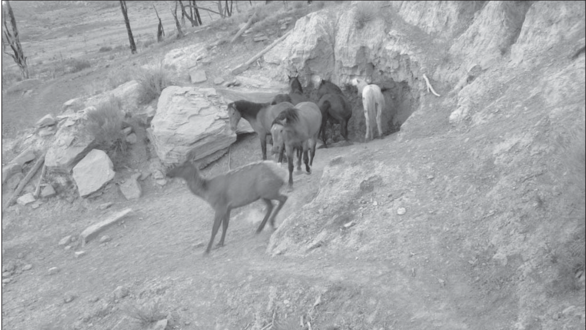
Figure 1. Feral horses ( Equus ferus caballus ) chasing off a cow elk ( Cervus canadensis ) at a natural spring in Mesa Verde National Park, Mesa Verde, Colorado, USA. Expanding feral horse populations threaten the health of public rangelands, and thereby the multiple-uses that rely on those rangelands—including native wildlife, recreation, and grazing (photo courtesy of Mesa Verde National Park).

overpopulation; the suite of tools currently permitted will not allow population goals to be achieved in a reasonable timeframe (NRC 2013). These policies continue to force agencies to implement management actions that have no hope of achieving AMLs within the upcoming decades.