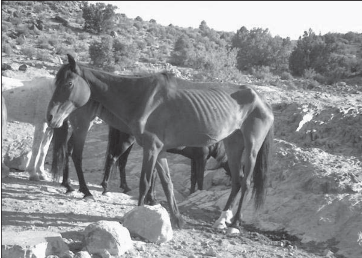
Figure 3. Overpopulation of animals increases the likelihood of starvation and dehydration for feral horses ( Equus ferus caballus ).

can negatively affect soil quality through compaction, reduce vegetation cover, spread invasive plant species, and impact water quality (Davies et al. 2014). In short, they can cause desertification of the rangeland and reduce the resiliency of the range; managing populations at appropriate levels can help minimize the effects of these non-native species.