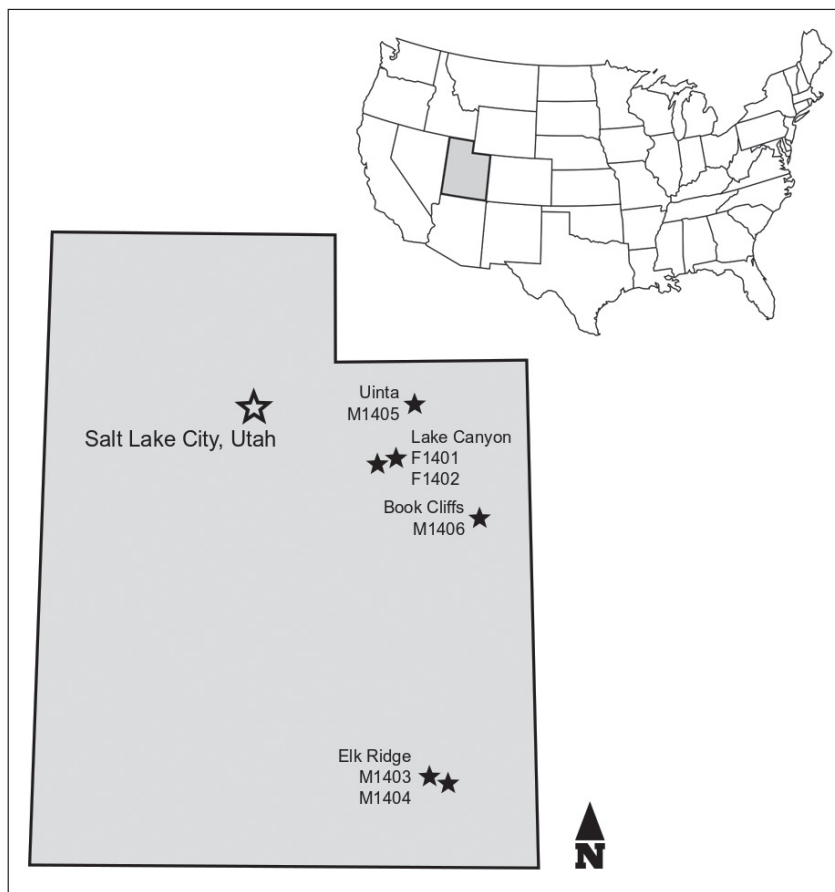
Figure 1. Release locations for 6 rehabilitated, orphan black bear ( Ursus americanus ) cubs in eastern and southeastern Utah, USA in December 2014.

of the Uinta Mountains (Uinta; 40.6^{\circ} N, -110.2^{\circ} W; Figure 1). Regional weather station data report that mean annual precipitation for Elk Ridge, Lake Canyon, Book Cliffs, and Uinta was approximately 51.8, 43.5, 51.7, and 77.1 cm, respectively, during the past decade (Menne et al. 2012). The variability in precipitation and topography among the sites produces a diversity of microclimates, with vegetative communities that are dominated by piñon ( Pinus edulis , P. monophylla ), juniper ( Juniperus osteosperma ), and oak ( Quercus gambelii ), and also include interspersed ponderosa pine ( Pinus ponderosa ), spruce ( Picea spp.), fir ( Abies spp., Pseudotsuga menziesii ), and aspen ( Populus tremuloides ). Lower elevations and drier microclimates contain big sagebrush ( Artemisia tridentata ) and high-desert shrubland communities. A comprehensive overview of the vegetation in these regions can be found in Banner (1992).