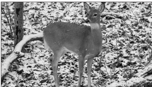
Figure 1. White-tailed deer ( Odocoileus virginianus )

To preserve native ecosystems, the governments of Argentina and Chile began a pilot eradication program to remove North American beavers ( Castor canadensis ) from Patagonia, according to The Washington Post . Beavers were introduced to the southern tip of South America in the 1940s in a failed Argentinian attempt to develop a fur trade. Now beavers number around 200,000 individuals. The bilateral eradication plan, originally developed in 2016, calls for the culling of at least 100,000 beavers. Some biologists assert that eradication might not be possible due to the remoteness of the landscape. However, containment of beaver populations should protect remaining forest and steppe habitats. Some Patagonian species, such as the Magellanic woodpecker ( Campephilus magellanicus ), may have benefitted from novel ecosystems created by beavers, but overall, beavers have wreaked havoc on forests dominated by tree species that lack coping and defense mechanisms against predation and stress caused by beavers.