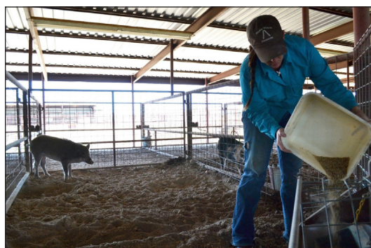
Figure 2. An individual pen for a wild pig ( Sus scrofa ) in the holding facility at the AgriLife Research Center, San Angelo, Texas, USA. We conducted research from May to June 2015 to evaluate the inclusion of ground blueberry juniper ( Juniperus ashei ) as a deterrent to wild pig consumption of supplemental pellets for white-tailed deer ( Odocoileus virginianus ).