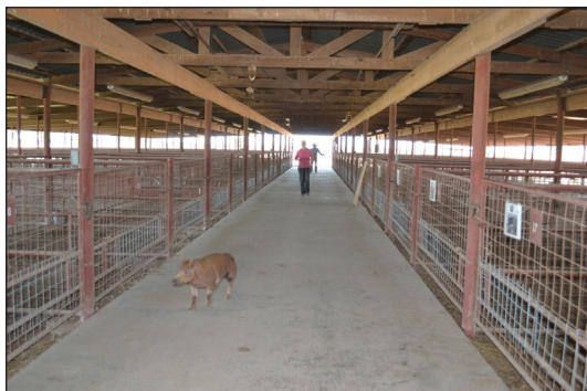
Figure 1. Wild pig ( Sus scrofa ) holding facility at the AgriLife Research Center, San Angelo, Texas, USA. We conducted research from May to June 2015 to evaluate the inclusion of ground blueberry juniper ( Juniperus ashei ) as a deterrent to wild pig consumption of supplemental pellets for white-tailed deer ( Odocoileus virginianus ).

Whole cottonseed ( Gossypium spp.) has been used as a supplemental food for deer because it is not palatable to non-target species (Cooper 2006, Taylor et al. 2013). Cottonseed contains gossypol, which is a plant secondary metabolite that can be toxic to monogastric animals but is more tolerated by ruminant animals (Reiser and Fu 1962).