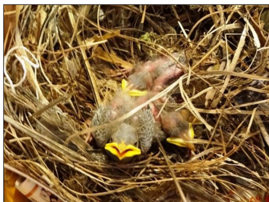
Figure 4. Nest with European starling ( Sturnus vulgaris ) chicks removed from aircraft, Naval Base Ventura County Point Mugu, Ventura County, California, USA (photo by L. Selner).

NAWS China Lake area occupies portions of Inyo, Kern, and San Bernardino counties.