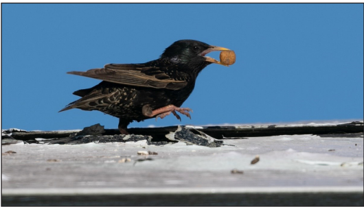
Figure 1. Adult European starling ( Sturnus vulgaris ) carrying food to nestlings in the wing of an aircraft on permanent display at Naval Base Ventura County Point Mugu Missile Park, Ventura County, California, USA.

new areas, damage crops, transmit disease, displace native cavity nesters, and compete for resources with native fauna (Linz et al. 2007). Estimates of starling damage annually in the United States exceed $800 million (Pimental et al. 2000). Starlings also threaten human safety when they strike aircraft. In 1960, Eastern Airlines flight 375 departed Logan International Airport in Boston, Massachusetts, USA, then crashed after ingesting starlings in 3 engines. All 62 people