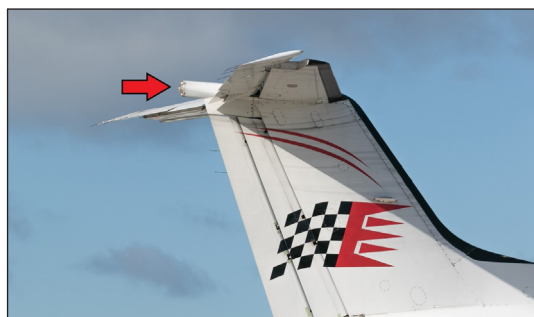
Figure 3. Location of European starling ( Sturnus vulgaris ) nest in aircraft tail fin, Naval Base Ventura County Point Mugu, Ventura County, California, USA (photo by J. Psiropoulos).