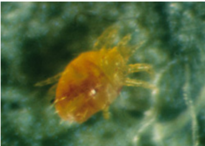
Zetzellia mali is a secondary predator, mostly of European red mite and rust mites, but will also feed on spider mite eggs (TFREC, Washington State University).

In order to encourage the survival of predatory mites in sufficient numbers, it is crucial to adopt sound, biologically-based pest management practices. The following are recommendations for encouraging predatory mites: