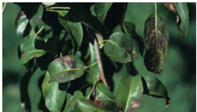
Spider mite injury to pear can cause rapid and severe leaf burn.