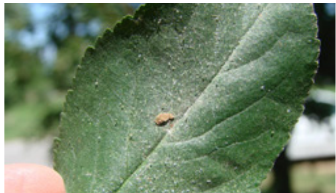
Spider mite injury to a tart cherry leaf; note stippling and debris caught in webbing on the leaf surface (Utah State University Extension).