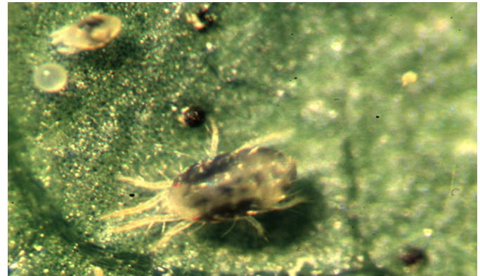
Two spotted spider mite adult, immature and egg.

Twospotted and McDaniel are the two most important web spinning species of spider mites (Order Acari, Family Tetranychidae) to attack Utah fruit orchards. However, twospotted spider mite tends to have a higher reproductive rate during hot summer conditions. For that reason, when both species occur together, twospotted spider mite often out competes McDaniel spider mite. Although 1 USDA ARS, Wooster, OH