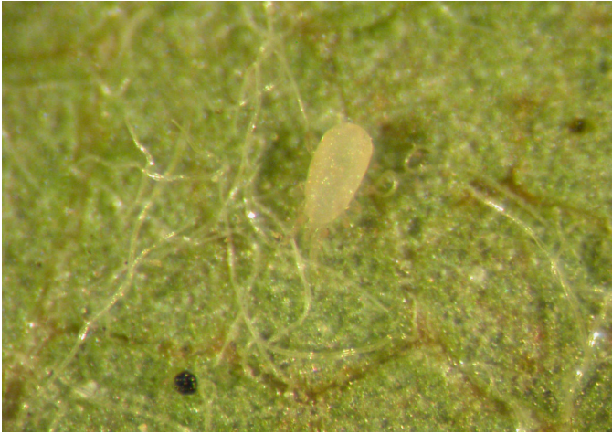
The western predatory mite is the most important predator in Utah orchards; it is teardrop-shaped and moves quickly (Utah State University Extension).