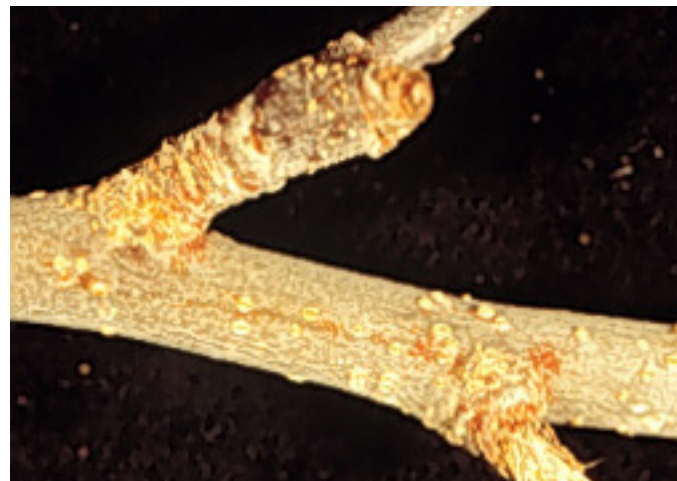
Overwintering eggs look like paprika sprinkled on twigs, buds, and spurs (Utah State University Extension).

There are three forms of immatures—larva, protonymph, and deutonymph—with a molt between each stage. A molt is where the cuticle or “skin” is shed. Each molt is preceded by a resting period during which the immature mite stops feeding and the body appears silvery.