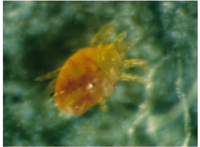
Zetzellia mali is a common predator of the European red mite.

If European red mite reaches economically damaging