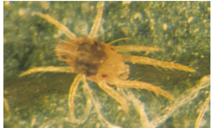
The male is yellow and green-black with a tapered hind end (B. Croft).