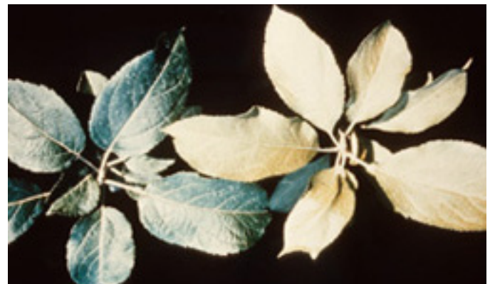
Feeding injury by European red mite to apple leaves on the right.

The European red mite is native to Europe and was first introduced into the Pacific Northwest in the early 1900s. Since then, it has spread and become established throughout the United States and Canada.