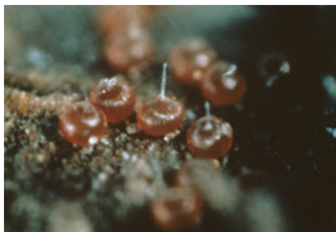
Eggs are spherical with a slender stalk on top.