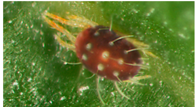
The female European red mite has a red body with white legs and hairs and spots on her back.