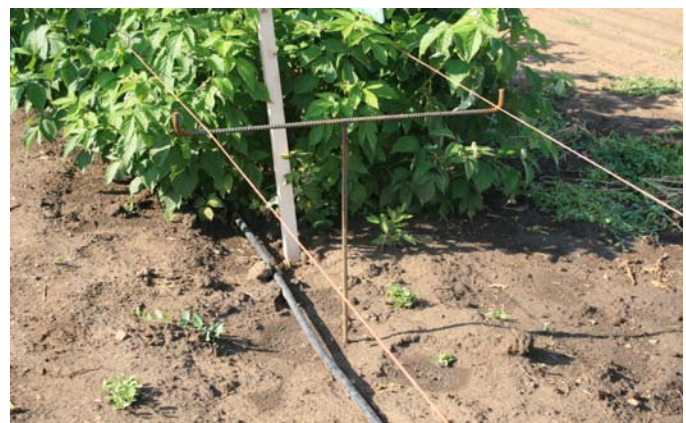
Figure 1. Trellis system for fall raspberries, consisting of baling twine and a t-post made of rebar.

Ten fall-bearing raspberry cultivars were planted in 2006. Each cultivar was grown in a plot measuring 12 feet long with 10 feet between rows, and 8 feet between plots within the row. Each plot was planted with six nursery-produced plants spaced 2 feet apart within the row, and alleyways were planted to grass. Irrigation was provided using both drip and overhead. Plant nutrient needs were supplied by applying 120 lbs of 16-16-16 (NPK) per acre in mid April and again in early June (banded in the row). Only the primocanes were cropped, as all the canes in each plot were pruned to ground level at the end of each season. Canes were supported with a temporary trellis system consisting of a single twine on each side of the row, supported by T-shaped rebar posts (Figure 1).