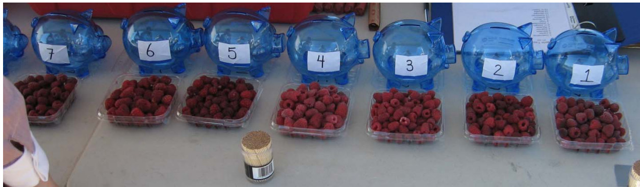
Figure 2. Consumer preference evaluations by farmers market attendees.

The planting was not treated with insecticides, in order to compare insect damage. Approximately weekly during June to August in each 2009-11, the number of canes with wilted tips and raspberry horntail larvae present were determined for each fall-bearing cultivar. Suspect canes were cut open and the presence, size, and location of horntail larvae and parasitoid wasps was determined (Figure 3).