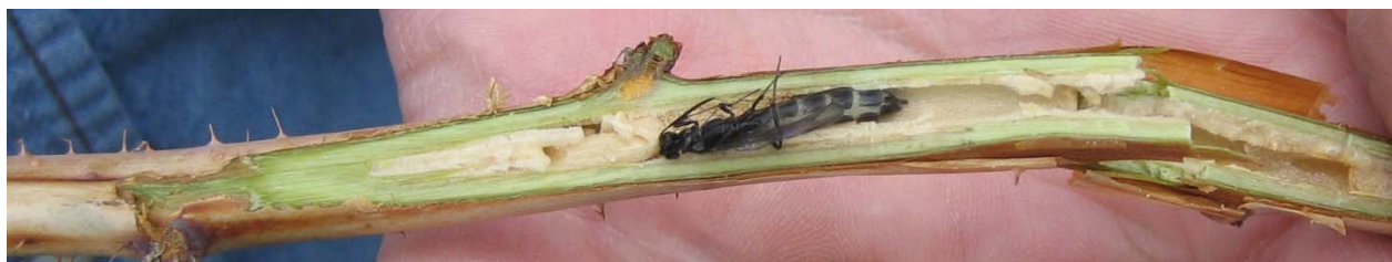
Figure 3. Raspberry horntail adult just prior to emergence from the floricane.