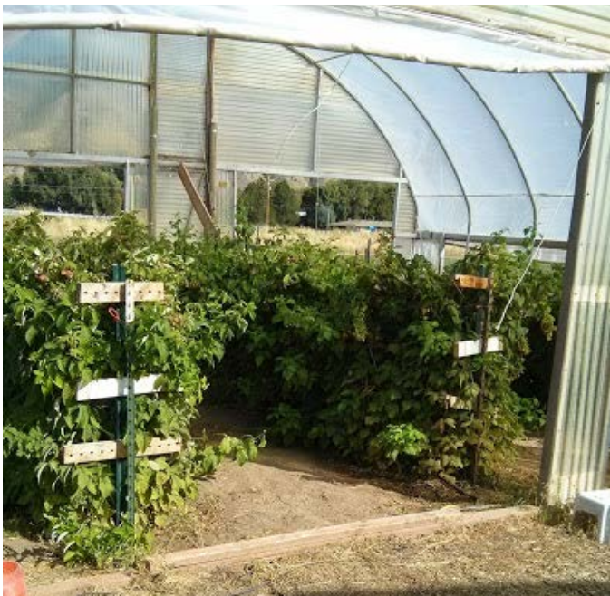
Image 2. Side-walls lifted to provide increased ventilation.

There may be some benefit to pushing earlier spring growth in primocane-bearing varieties to bring them into production earlier. However, in the trials done in Logan, UT no benefit of pushing floricanes to produce earlier in the spring was observed. The more effective approach has been using the high tunnel to keep flowers and fruit from freezing in the fall.