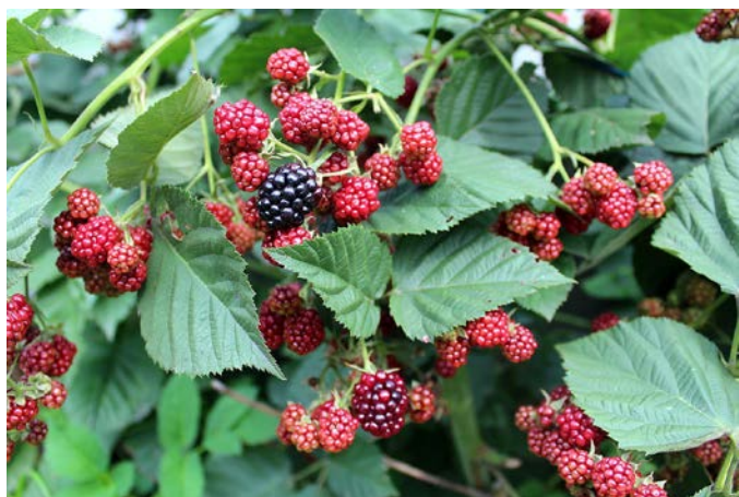
Image 3. Blackberry fruit.