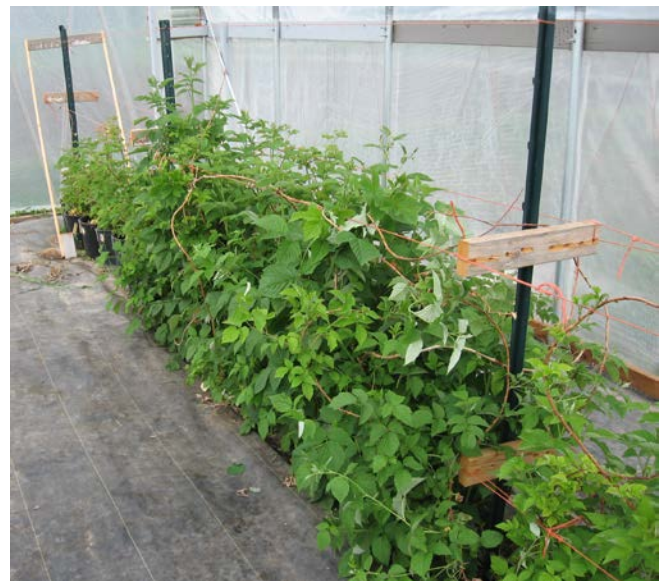
Image 1. Blackberry T-trellis.

Temperature management is an important component of high tunnel production. High tunnel air temperature can