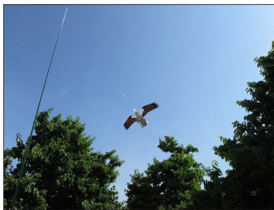
Figure 3. A hawk-kite in a sweet cherry ( Prunus avium ) orchard in Michigan, USA.

able cost-benefit ratio with regard to pest bird management in sweet cherry ( Prunus avium ) orchards. Thus, fruit farmers have some awareness of the potential financial benefits of managing bird damage with natural predators, which should enhance adoption in some of the contexts described in the next paragraph.