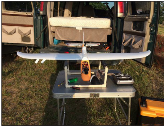
Figure 4. A fixed-wing drone used in experiments in sweet cherry ( Prunus avium ) orchards, Michigan, USA, in 2018.

damage (Berge et al. 2007, Wang et al. 2020) and is viewed as an effective management strategy by many farmers (Anderson et al. 2013). However, it has substantial costs in labor and materials and is not generally an option for tree crops. Falconry is more expensive than other management techniques. Although it reduced blueberry damage in the Pacific Northwest of North America (Steensma et al. 2016), it did not reduce damage to rice by local swamphens ( Porphyrio porphyria ) in Spain (Moreno-Opo and Piqué 2018). Handheld lasers reduced geese abundance and increased sward height in treatment plots compared to control plots in Danish pastures (Clausen et al. 2019). More up-to-date laser devices that provide a constant, moving beam of laser light over fields are currently being tested (Brown et al. 2019). Large-scale population suppression (e.g., through trapping) is not likely to be effective beyond local scales (Linz et al. 2011).