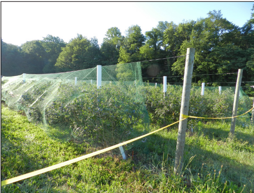
Figure 6. Netting in a blueberry ( Vaccinium spp.) field in Michigan, USA.