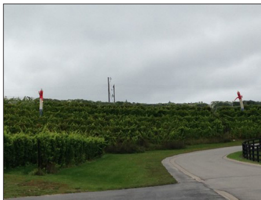
Figure 2. Two inflatable tube men in a vineyard in Michigan, USA (photo courtesy of S. Wieferich).