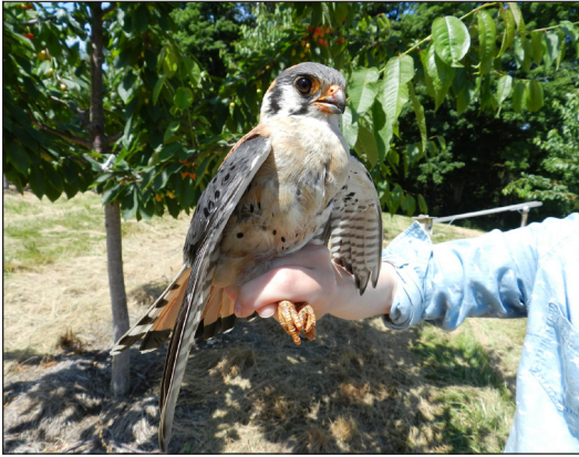
Figure 5. An American kestrel ( Falco sparverius ), which deters pest birds, in a sweet cherry ( Prunus avium ) orchard in Michigan, USA. Kestrels can be attracted to orchards by installing next boxes on poles.