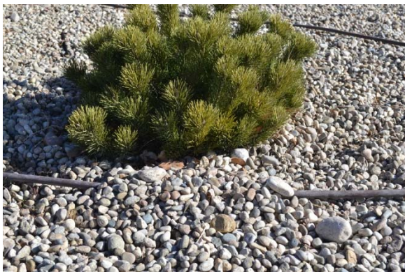
Figure 6. Drip tubing can be covered by mulches to improve aesthetics.

Covering bare ground with mulch helps reduce evaporation of water from the soil. This gives plants the opportunity to utilize the water in the soil before it is evaporated into the air. Mulches can also be used as a weed barrier. Competition from weeds reduces the amount of water available for desirable plants to use. When selecting a mulch it is important to keep in mind that some mulches require more maintenance than others. For example, a rock mulch does not need to be replaced as often as bark mulch. However, rock mulches are usually significantly more expensive than bark mulches. Another benefit of mulches is that if drip tubing is being used the mulch can cover up the tubing making the landscape more aesthetically pleasing (Figure 6).