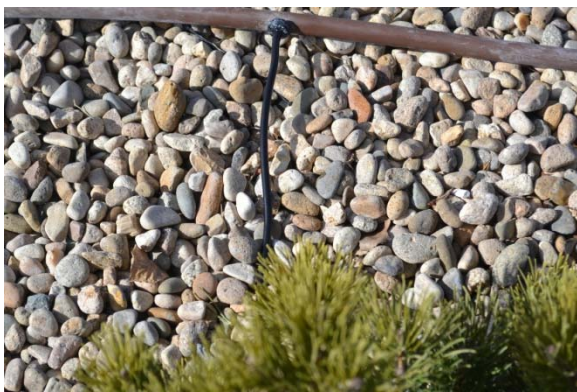
Figure 3. Drip emitter attached directly into the main line with tubing extending to the plant.

Drip systems place water directly in the soil. This reduces evaporation and also puts water exactly where the plant needs it. (Figure 3)