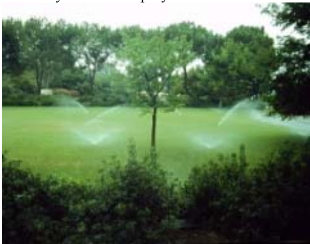
Figure 1. Rotary and spray heads such as these mixed on the same zone result in non-uniform irrigation.

Each type of sprinkler differs greatly in the amount of water that it applies. The two most common types of sprinkler heads used in landscape irrigation are rotary heads and spray heads.