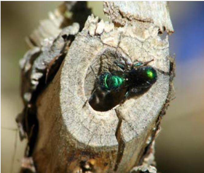
Fig. 7. The bee Osmia kincaidii returns to her nest in the hollow of a dried forsythia stem.

There are more simple and effective options to accommodate twig- and stem-nesting bees in the garden. When pruning shrubs, note those that have hollow or pithy cores; some twig-nesting bees use these substrates. Instead of cutting dead stems to the ground when pruning or thinning, leave a foot-long stub for the bees. Small carpenter bees (genus Ceratina ) will excavate nest cavities in dead pithy canes of raspberries and roses, or cut twigs of sumac, and dead stems of plume grass, fireweed, Russian sage, or even old flowering stalks of goldenrod, Echinacea and Iris reticulata (Fig. 3). Some species of Osmia and Hoplitis bees (smaller relatives of blue orchard bees) use dead hollow twigs, too, such as those of the larger stems of forsythia, or bamboo garden stakes if not cracked (Fig. 7). There is much opportunity for new observations and experiment here.