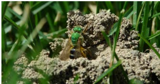
Fig. 1. Brilliant green Agapostemon bee emerging from a ground nest in a suburban lawn.

Utah is home to about 1,000 named species of native bees, with several hundred species living in any one valley and adjacent montane habitats. Urbanization takes its toll on native bees, but many species can persist with a little help from gardeners and landscapers. Like birds, bees have two primary needs in life: Food (for a bee, pollen and nectar) to feed themselves and their offspring, and a suitable place to nest. An earlier fact sheet ( Gardening for Native Bees in Utah and Beyond ) offers a rich tapestry of garden flowers that provide bees with nectar and/or pollen. We know far less about accommodating the nesting needs of our native bees, but there are certain practices that favor or disfavor their nesting.