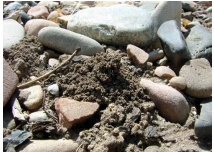
Fig. 2. Nest tumulus (soil heap) thrown up by the bee Halictus rubicundus nesting amid a decorative pebble mulch.