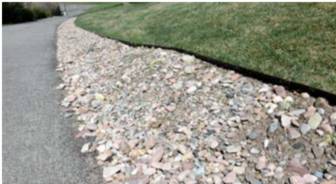
Fig. 5. A bare earth slope with nesting Halictus rubicundus bees was sodded in the fall to control erosion. Rather than sacrifice its nesting aggregation, however, a long strip of shallow rock pebble mulch was provided over bare soil. Several thousand emerging bees nested in the rock mulch strip the following spring.

Nest sites of seemingly suitable soil can be created, but many years may pass before the site is discovered by a colonist bee. Moreover, nests of many bee species have never been seen or described. For these reasons, there is little experimental evidence to guide gardeners and landscapers in the creation of attractive soil substrates for bees. Recent research shows that at least one common ground-nesting bee, Halictus rubicundus , prefers to nest amid a sparse surface mulch of stream pebbles or cobbles rather than in mere bare ground (Figs. 2 & 5). Vertical banks of heavier soil, if at least a foot high, will attract nesting by some bees, especially various sweat bees. In nature, these bees like to nest in cut-banks of streams. Keeping some small patches of well-drained bare sunny soil surfaces can attract nesting too.