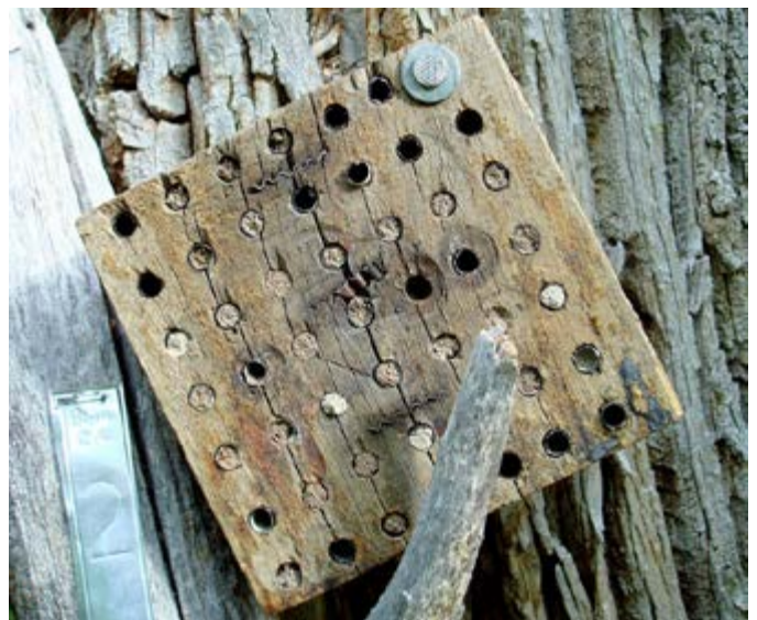
Fig. 9. Drilled wooden nest block with paper straw liners. Note mud nest plugs of blue orchard bees.

Unlike most social wasps (e.g., yellowjacket, hornet) and bees (e.g., honey bee, bumble bee), these non-social bees have little, if any, venom in their weak stingers. They won't sting you unless physically handled. Curiosity, not fear, should be your rational response to their presence in the garden.