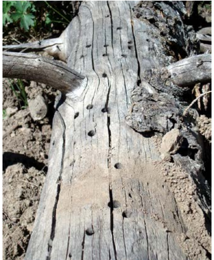
Fig. 8. Emergence holes of wood-boring beetles are often used by cavity-nesting bees.

Other species nest in wood. Large carpenter bees chew their own burrows in sound wood. In Utah, they are limited to the southern counties. Other wood nesters (e.g., mason bees, leaf-cutting bees, solitary wasps) adopt burrows left by wood-boring beetles in dry deadwood and sometimes other cavities (Fig. 8). Their local nesting needs can be met using drilled wooden blocks with paper straw liners, cut reeds or hard paper tubes of suitable dimensions (Fig. 9) (for more details, click here ). Regular sanitation and replacement of nesting substrates, such as straws, is necessary to help check multiplication of their diseases and parasites.