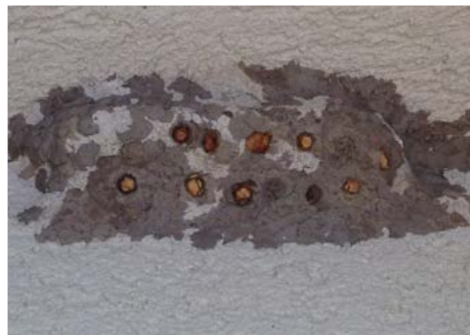
Fig. 4. Leafcutter bee cells in a mud nest built by dirt dauber wasps.

Utah is home to about 1,000 named species of native bees, with several hundred species living in any one valley and adjacent montane habitats. Urbanization takes its toll on native bees, but many species can persist with a little help from gardeners and landscapers. Like birds, bees have two primary needs in life: Food (for a bee, pollen and nectar) to feed themselves and their offspring, and a suitable place to nest. An earlier fact sheet ( Gardening for Native Bees in Utah and Beyond ) offers a rich tapestry of garden flowers that provide bees with nectar and/or pollen. We know far less about accommodating the nesting needs of our native bees, but there are certain practices that favor or disfavor their nesting.