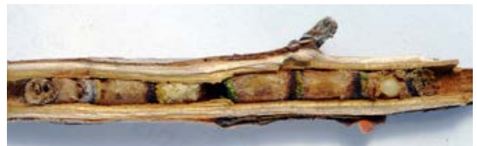
Fig. 3. Nest with cocoons of the bee Hoplitis sambuci excavated in the pith of a dead sumac twig.