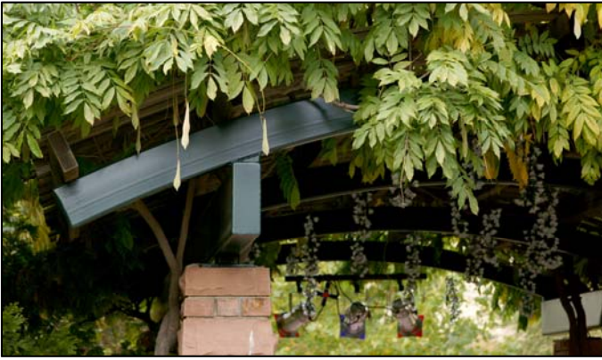
Example of a well-built structure suitable for long-term growth of wisteria.

within its allotted space. Trim each shoot of flowering wood (last year's growth) to 6-12 inches. Avoid cutting into 2-year-old wood, as this stimulates excessive vegetative growth that interferes with flowering. After they have finished flowering, remove about half of each new long vine. Repeat this process each year to have large showy panicles of flowers.