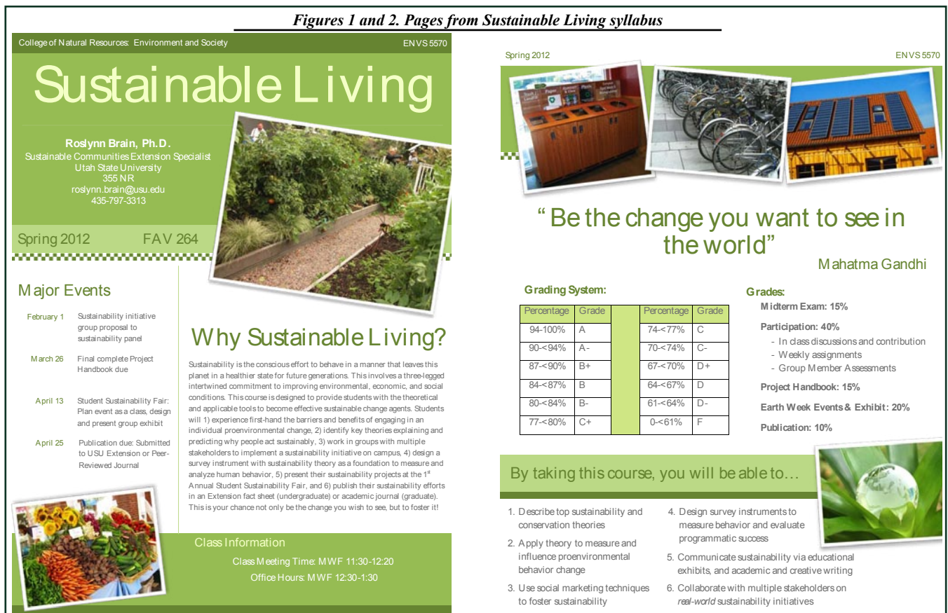
Figures 1 and 2. Pages from Sustainable Living syllabus

1. Students selected an area on campus to conduct a sustainability audit and submitted letters to the deans/facilities staff/administrative staff regarding