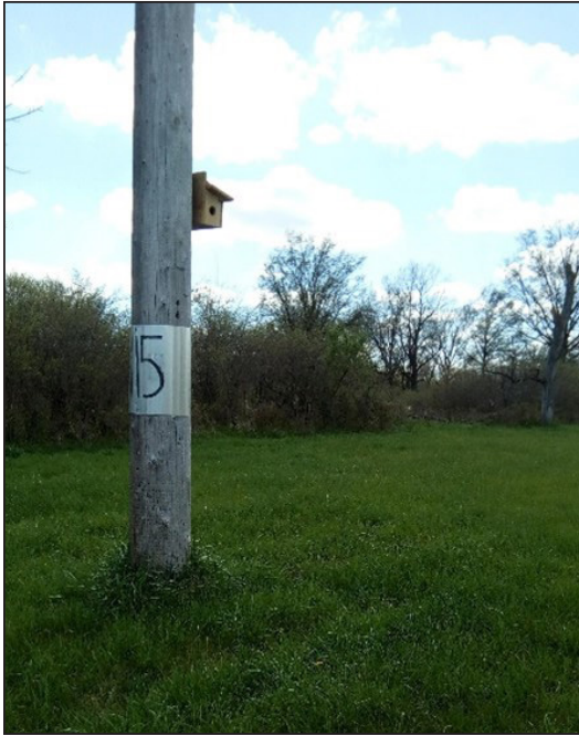
Figure 2. Image of a wooden nest box and predator guard below box, 1 of 120 nest boxes located on the 2,200-ha National Aeronautics and Space Administration Neil Armstrong Test Facility (formerly the Plum Brook Station), Erie County, Ohio, USA (41° 22' N, 82° 41' W). These boxes were used to evaluate European starling ( Sturnus vulgaris ) response to human disturbance at nest sites during spring and summer 2020. This image was published originally in Blackwell et al. (2018).

box triplets were distributed spatially across our study area and, subsequently, evenly regarding entrance orientation.