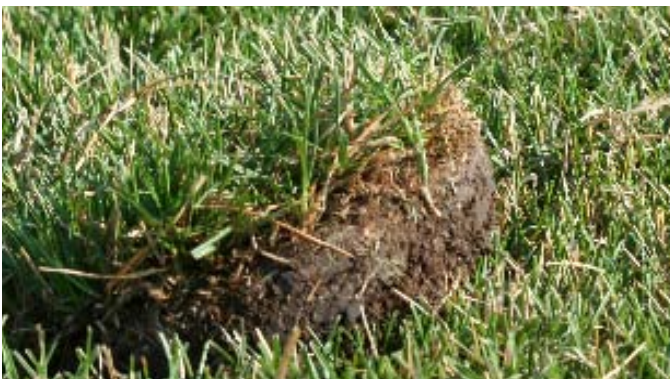
Fig. 10. Taking soil cores will help determine the level of billbug infestation. 1

As with all soil-dwelling insects, early billbug detection is difficult. Affected turfgrass areas should be scouted regularly in the summer by gently pulling blades from the crown. If the grass breaks off easily (Fig. 2) or hollow stems are visible, consider taking soil samples. Take at least four evenly spaced samples for the area. Cut a 6" x 6" square with a hand trowel to examine the upper 2" of the root zone (Fig. 10). After looking through the soil and thatch layer, replace the soil and return the turf. The treatment threshold for billbugs in turfgrass is an average of 1/ft 2 or 0.25 larvae for a 6" x 6" square with obvious visible crown damage.