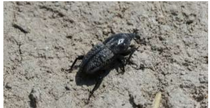
Fig. 6. Adult billbugs can be seen walking from sheltered areas to turfgrass in the spring. 1

Billbugs typically have one generation per year. Hunting and bluegrass billbugs overwinter in the adult stage and Denver billbugs can overwinter as adults or as full-grown larvae. When temperatures begin to warm in the spring, adults become active again and move from sheltered areas to turfgrass (Fig. 6). Mated females lay eggs in plant stems near the crown. Young larvae feed on grass blades near the crown, but will eventually move just below the thatch layer to feed on roots. Larvae feed until mid-July and pupate within the soil. Adults emerge in late July and are active in turfgrass for a few weeks before moving to sheltered areas for the winter.