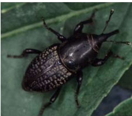
Fig. 7. Denver billbug. 2

Adult billbugs are weevils or sometimes referred to as "snout beetles" because their chewing mouthparts are located at the end of a snout along with elbowed antennae. Adults are slow-moving insects and will play dead if disturbed. Adult billbugs are black or grey, and like most beetles, have hardened forewings. Denver billbugs, Sphenophorus cicatristriatus , are also called Rocky Mountain billbugs. Adults are large and can reach up to ½" in length, and have impressions on the forewing that look like deer hoof prints (Fig. 7). Denver billbugs infest cool-season grasses in the Rocky Mountains and northern Great Plains. Hunting billbugs, Sphenophorus venatus , are one of the most widespread turfgrass pests in the U.S. Adults can reach up to ¼" in length and have distinct longitudinal grooves on the forewings (Fig. 8). Hunting billbugs infest warm-season grasses, like bermudagrass and zoysiagrass, and commonly attack sod farms. Bluegrass billbugs, Sphenophorus parvulus , are the most serious pest of bluegrass and perennial ryegrass in the northern U.S. and southern Canada. Adults are slightly smaller than hunting billbugs, and reach about 5/8" in length. Bluegrass billbugs are common wherever cool-season grasses are grown (Fig. 9).