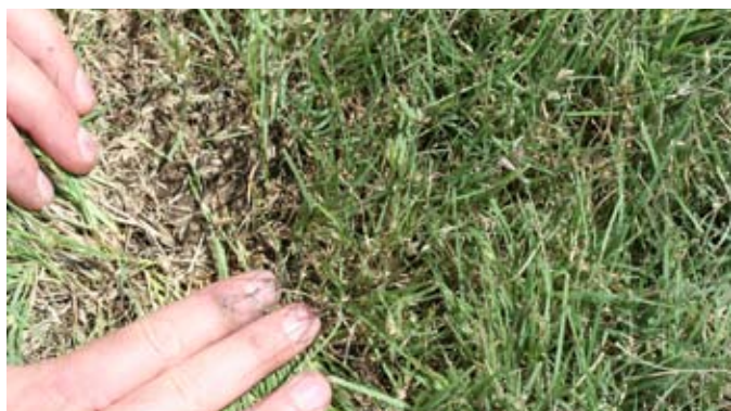
Fig. 1. Billbug feeding will cause the crown to turn brown and die. 1

B illbugs can be a serious turfgrass pest throughout the entire U.S., with at least eight species known to occur. In Utah, two species have been detected (Denver and bluegrass billbugs) and reported to cause turfgrass damage (Fig. 1). Although not a new pest to turfgrass, billbugs are often ignored or misdiagnosed, and root decline is confused with drought stress, fungal disease, or other insects. In most cases, damage is diagnosed as dollar spot disease or white grub feeding. Sod farms and golf courses seem to be especially affected by billbugs because turfgrass is well maintained. Newly-laid sod should be carefully monitored for the presence of billbugs.