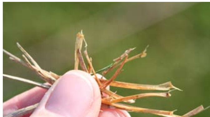
Fig. 2. Turfgrass infested with billbugs looks brown and can easily be pulled away from the crown. 1

Billbug larvae are the damaging life stage. The greatest injury to turfgrass usually appears from mid-June through late July, although billbugs can be feeding all summer. Initially, young larvae will hollow out stems and cause discoloration, but will move down to the crown and into the thatch layer as they mature. Turfgrass will look drought stressed with small brown patches appearing (Fig. 1). Eventually billbugs will consume the roots and destroy the entire root system. Blades of grass can easily be pulled away from the crown with billbug infestations (Fig. 2). Turfgrass root decline is often associated with white grubs or other insects, but billbugs deposit frass, or excrement, in the thatch layer (Fig. 3). Sawdust-like frass indicates billbugs even if you do not see larvae feeding.