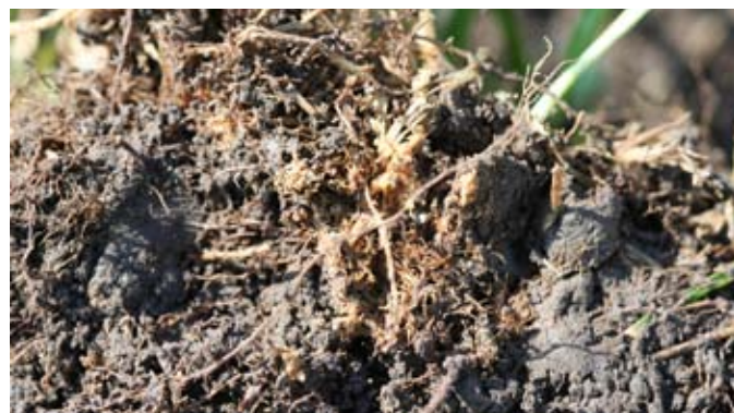
Fig. 3. Billbugs leave behind brown, sawdust-like frass in the thatch layer. 1