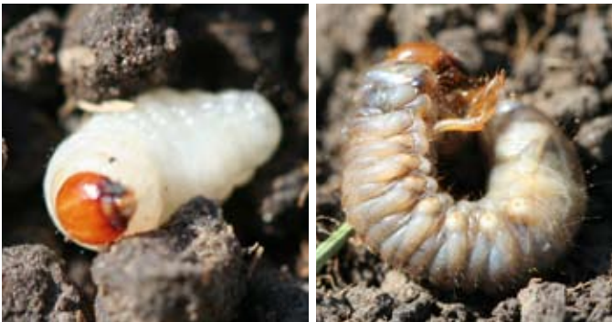
Figs. 4 and 5. Examples of a common billbug (left) and white grub (right). 1

Although in different beetle families, billbugs sometimes can be confused with white grubs. There are a few common characters that distinguish the larvae. Billbugs are legless, have cream-colored bodies with a brown head, and have a slight curve to the body; larvae look like a grain of puffed rice (Fig. 4). By comparison, white grubs have three pairs of legs, have dirty grey-colored bodies with a brown head, and have a C-shaped curve to the body (Fig. 5). Full grown billbugs can reach up to ½" in length while white grubs can reach 1". While both types of larvae feed on turfgrass roots, white grubs are generally feeding well below the thatch layer.