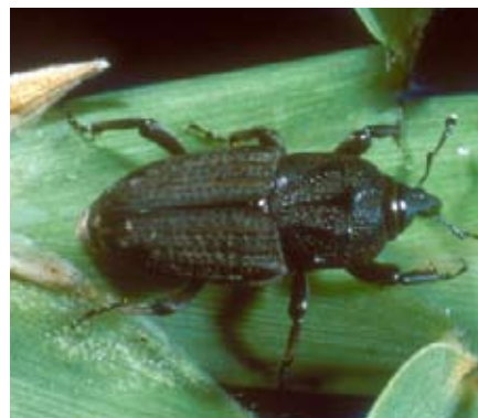
Fig. 8. Hunting billbug. 3