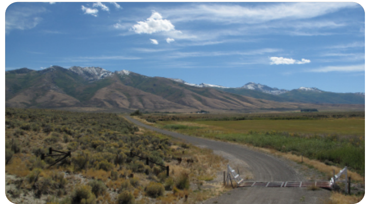
Roughly 80 percent of Utah land is used as rangeland, which could play a major role in offsetting carbon dioxide emissions.

The capture and long-term storage of carbon dioxide (CO 2 ) from the air.