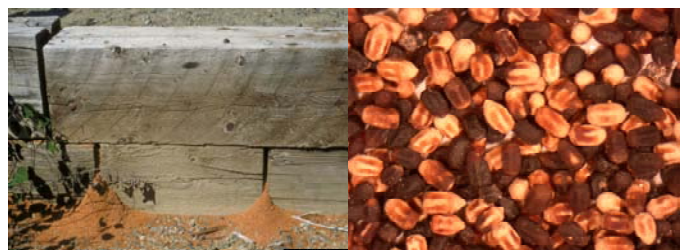
Fig. 8. Comparison of ant and termite frass. Left: carpenter ant frass (sawdust-like) 6 ; right: drywood termite pellets (6-sided, hard, woodlike pellets, ~1mm long) 7 .

Cultural Control Options: All control options must start with proper identification of the pest ant; it is very likely that the ants in your home are not carpenter ants. While insecticidal treatments may provide a temporary solution, treating conditions favorable to carpenter ant colonization is paramount to long-term control. Carpenter ants prefer wood with high moisture content, especially when the wood is infested with mold and/or fungi.