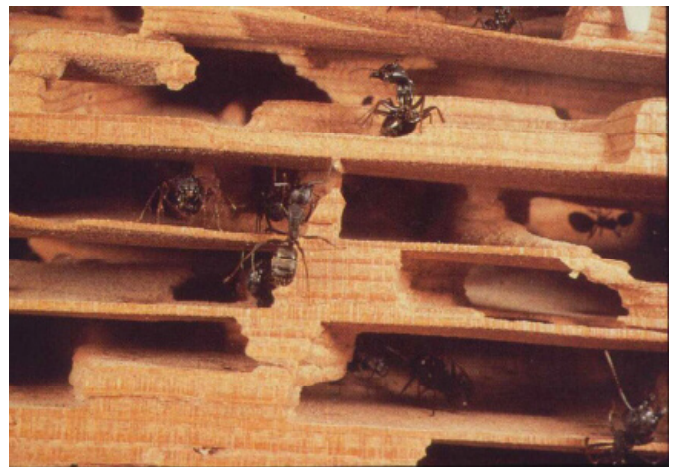
Fig. 7. Carpenter ant tunnels. 5