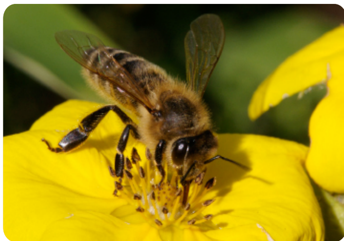
Honeybee pollination is a critical piece of the food chain.

Be sure to research and understand local laws, ordinances, and regulations regarding beekeeping in a residential setting. In some instances, you may have to obtain permits. Depending on where you want to place your hives, it may be wise to check with your