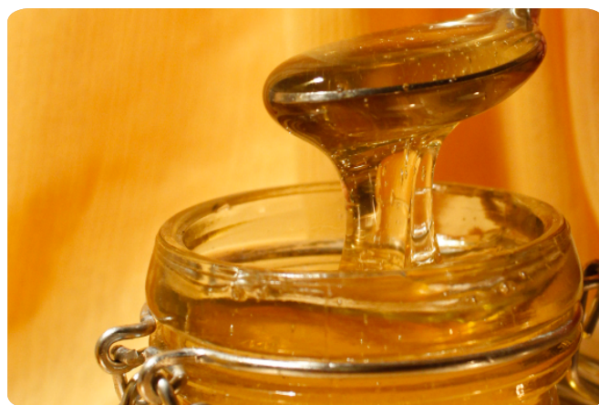
Honey provided by backyard bees.

Wearing a protecting suit, remove frames from the hive and slice the wax caps off. Strategies to remove the frames vary depending on your preference. A good starting point for various removal methods can be found on New South Wales Department of Agriculture's "Removing Honey From the Hive" fact sheet, at http://bittyurl.co/4nga . The frames are placed in an extractor and then by spinning for several minutes, the honey is freed from the frames. 3 The honey can then be poured into clean, dry jars for storage. As with any food handling, it is important to make sure all equipment and surfaces used in packaging your honey is kept as clean as possible. If you intend to sell your honey product, you will need a food handler's permit and access to a commercial kitchen. For any questions or technical assistance, contact the USDA Bee Biology and Systematics Laboratory at USU, http://uaes.usu.edu/hm/farms-and-facilities/usda-bee-biology-and-systematics-laboratory/ .