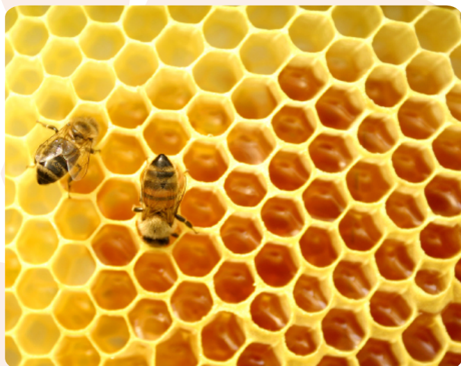
A closeup of the honey-making process.

There are three kinds of bees in a colony – the queen, the drone and the worker. 3 The queen is the mother of all bees in the hive and her primary job is to lay eggs. The majority of bees in a hive are workers and they perform most of the functions necessary to the health of the colony. These functions include foraging, hive cleaning, brood care, and hive defense. A drone's only function is to fertilize the queen. Even though there are three kinds of bees, the queen, the drone, and the workers in a hive, the colony functions as a single unit, and the efficiency of the colony relies on these relationships. When one part is threatened, the entire colony reacts.