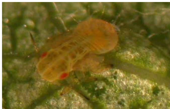
Fig. 2. Pear psylla nymph 1

Pear psylla ( Cacopsylla pyricola ), a western Europe native, is a very small sap-feeding insect and is considered the most serious insect pest of pear in the United States. Serious infestations can stunt, defoliate, and even kill trees. Psylla feeding produces copious amounts of sticky honeydew that can cause fruit russetting. All commercial pear varieties are attacked, although smooth skinned pears are more injured than russeted varieties, and Asian and red pears are less prone to injury than European and green pears.