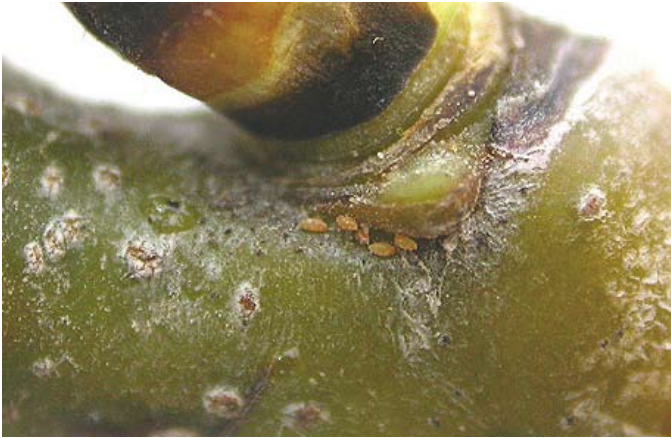
Fig. 3. Pear psylla eggs at base of bud 2