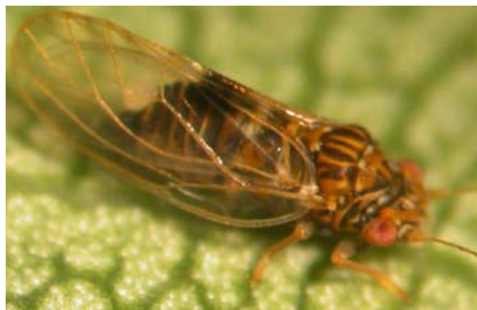
Fig. 1. Adult summer form pear psylla 1