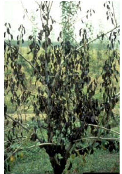
Fig. 4. Pear decline caused by phytoplasma transmitted by pear psylla 3

Pear psylla transmits a phytoplasma that causes "pear decline" (Fig. 4) This disease has killed thousands of trees in the western U.S. and Canada. It prevents nutrients from moving down the tree and results in root starvation. Symptoms include stunted shoots, small or curled leaves, reduced fruit size, twig dieback, and premature leaf drop. Highly susceptible root stocks can die quickly. Pear rootstocks are available that are tolerant of the disease even with severe psylla feeding.