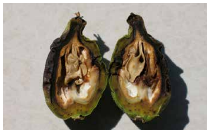
Fig. 3. Shriveled walnut kernel caused by husk fly injury occurring in July to early August.