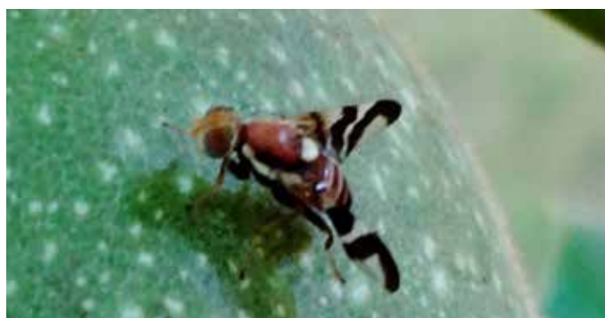
Fig. 1. Walnut husk fly adult on walnut husk. Note the inverted V-shaped banding pattern on the wing tips.