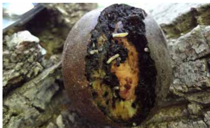
Fig. 2. Walnut husk fly larvae feeding in walnut husk. Decayed husks are difficult to remove and cause nut-shell staining.