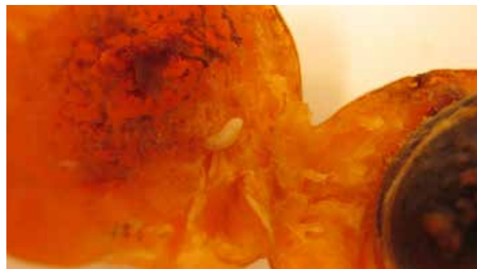
Fig. 4. Walnut husk fly larva tunneling in ripe apricot fruit.

Walnut husk fly (Order Diptera, Family Tephritidae; Fig. 1) is the most common insect pest of walnuts in Utah. Husk fly larvae (maggots) tunnel in walnut husks, causing them to soften and decay, and stain the shell (Fig. 2). Damaged husks are difficult to remove. If husk fly infestation occurs early in kernel development, nuts may shrivel, darken, become moldy, and drop from the tree (Fig. 3). For commercial producers, discolored shells result in reduced quality for in-shell sales, and nut loss lowers profits. For home gardeners, difficult removal of softened husks is the primary problem. The husk fly also infests ripe apricot and peach fruits, usually only when infested walnuts are nearby. The larvae chew tunnels in fruits causing reduced quality and decay of the flesh (Fig. 4).