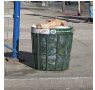
Figs. 6-9. Examples of places around the home where stagnant water could be prime mosquito breeding areas, including clogged gutters, bird baths, wheelbarrows, and garbage receptacles.