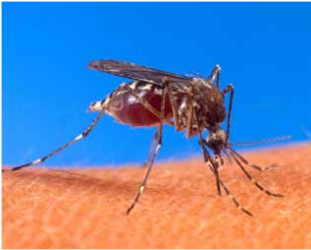
Fig. 5. Typical female mosquito feeding. 2