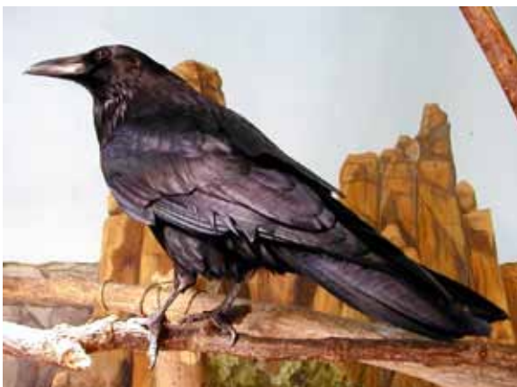
Fig. 4. Ravens are common in Utah and are more susceptible to West Nile Virus than other birds.

At least 138 bird species are susceptible to WNV and can die from an infection. In general, crows, ravens and jays are particularly sensitive to WNV and are the most commonly seen dead birds (Fig. 4). There is no evidence people can get WNV from handling live or dead birds infected with the virus. However, persons should avoid bare-handed contact when handling any dead animals, and use gloves when collecting dead birds in plastic garbage bags. Otherwise, contact local health department for guidance or bird removal.