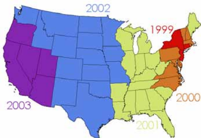
Fig. 1. Spread of West Nile Virus in the United States since first detected in 1999.

West Nile Virus (WNV) was first detected in Uganda in 1937. For several years, WNV remained relatively contained in Africa, Europe and the Middle East. Eventually, WNV was detected in North America in 1999 with the first cases in New York City. Since 1999, WNV spread to all the lower 48 U.S. states by 2004 (Fig. 1). WNV has also been detected in Canada, Mexico, Puerto Rico, Jamaica, Guadeloupe, El Salvador, and the Dominican Republic. More than 15,000 people have been infected with WNV in the U.S. since 1999. Unfortunately, more than 500 people in the U.S. have died as a result of secondary complications with WNV.