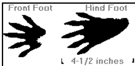
Figure 1. Raccoon paw prints

Raccoons are a grizzled gray in color and are easily distinguished by their bushy tails with alternative black or gray rings, and black mask across their faces. The print of the hind foot faintly resembles that of a small child (Figure 1).