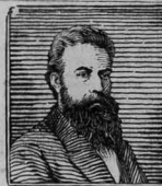
WILLIAM CONRAD ROENTGEN

HOME ECONOMICS CLUB The Home Economics Club will meet in the club room at 1 o'clock Friday. The club hopes to have every girl registered in the school of