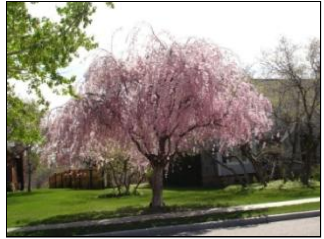
Double Pink Weeping Cherry