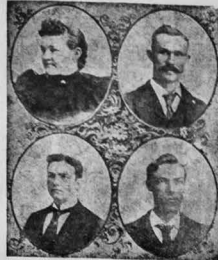
GRADUATION COMMITTEE PERSONNEL REVEALED