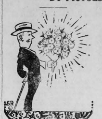
A Maidens Dream of a Rom Date