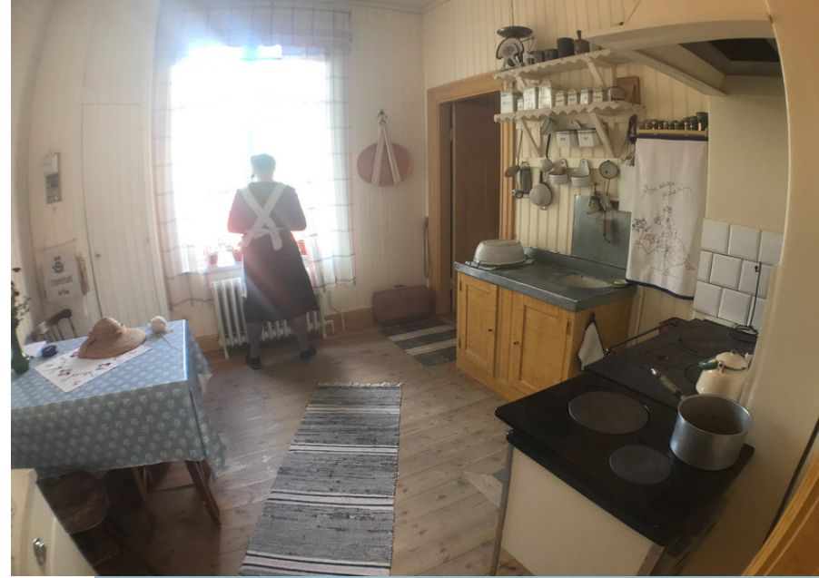
Kitchen from 1914-1945 at Skansen Museum in Stockholm, Sweden