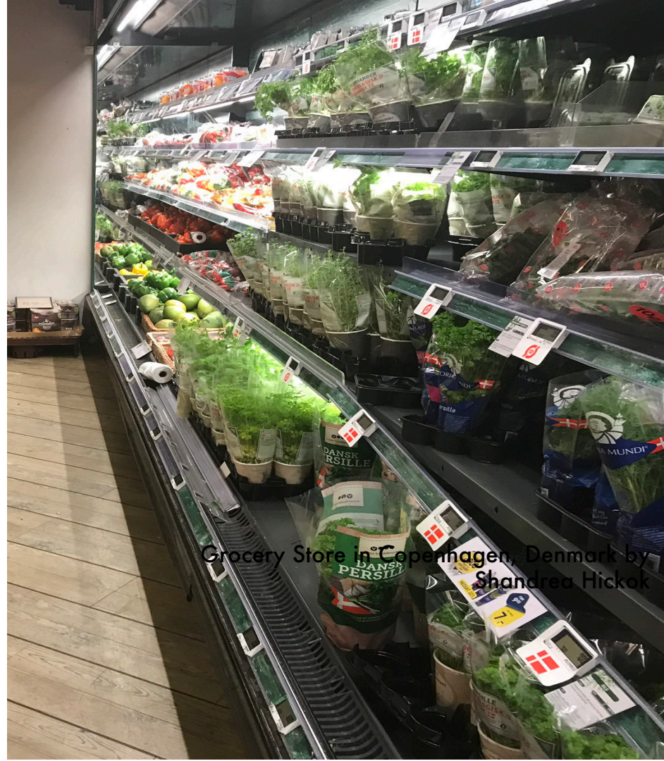
Grocery Store in Copenhagen, Denmark

Source: Global Sustainable Competitiveness Index