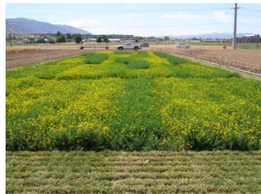
Figure 1. Variety trial plots of birdsfoot trefoil (yellow flowers) and alfalfa (darker green) in the seeding year 2005 (above) and the establishment year 2006 (below).

In 2008 and 2009, forage DM yield was determined using a non-destructive rising plate meter (RPM) calibrated separately for birdsfoot trefoil and alfalfa. Five RPM readings were taken in each plot, and then a calibration sample was cut from the area under the RPM in the same plot. Calibration samples were oven-dried and a calibration curve was developed to predict the DM yield of birdsfoot trefoil. The same process was used to develop a RPM calibration curve for alfalfa. All forage was removed above a 3-in stubble height from plots on each harvest date.