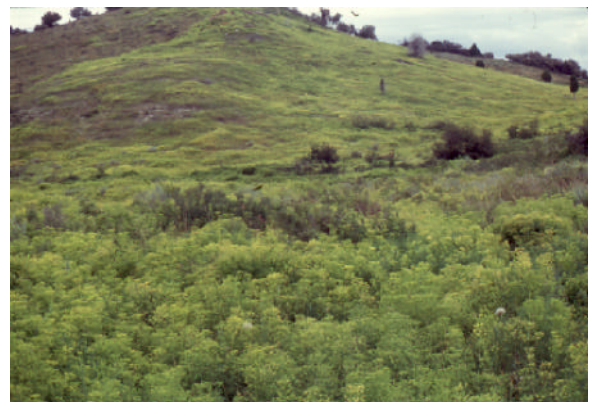
Leafy spurge infestation “out of control” and expanding.