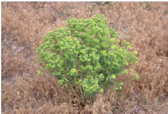
Single leafy spurge plant—the beginning of a new noxious weed infestation.

Weed infestations enlarge and spread much like wildfires, beginning small, then expanding to cover huge areas if not controlled quickly. Weed seeds, like embers, can be carried long distances by wind or other means. Resulting new “spot” infestations grow and merge, much like spot fires ahead of an advancing fire front.