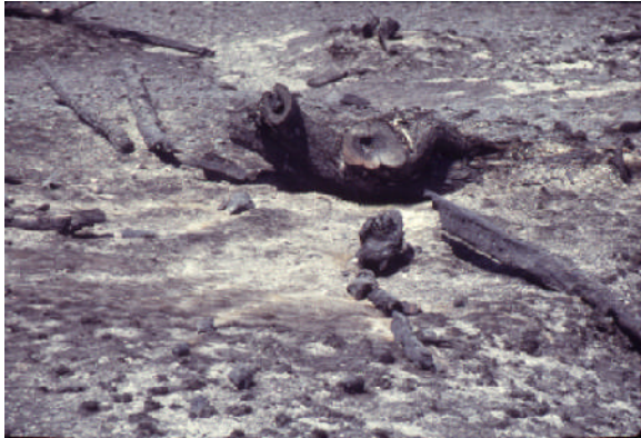
Temporary impact of wildfire on plants and animals.

Like an unwanted wildfire, noxious weeds can drastically affect wildland plant and animal communities, damage watersheds, increase soil erosion, and adversely impact recreation. However, unlike the temporary negative impacts of wildfire, ecological damage from extensive noxious weed infestations is often permanent. Lands affected by wildfire are self-healing, whereas lands invaded by noxious weeds don't return naturally to their pre-invasion condition. Weeds continue to spread and the damage worsens.