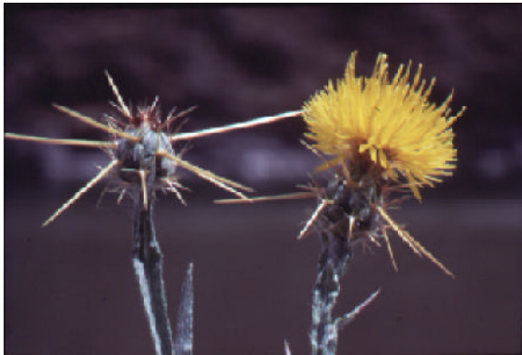
Wildlife habitat, wilderness, and recreation areas invaded by yellow starthistle.

Invasive noxious weeds have been described as a raging biological wildfire—out of control, and spreading rapidly. The devastation from these alien plants includes enormous economic losses to agriculture and irreparable ecological damage to wildlands. Millions of acres have been invaded or are at risk including rangelands, forests, wilderness areas, national parks, recreation sites, and wildlife management areas.