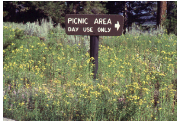
Picnic areas and campgrounds overrun by St. Johnswort.

Wildfires and weeds share much in common, including impacts, spread, and management.