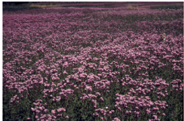
Permanent change in wildland plant and animal community caused by noxious weeds.

When considering long-term ecological effects on the land, invasion by aggressive non-indigenous noxious weeds is far more damaging than any wildfire.