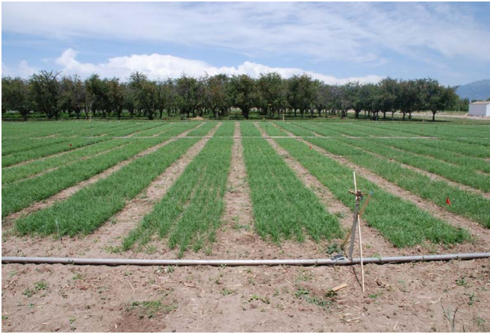
Figure 2. A young stand of teff in a USU field trial in Kaysville, UT (2010).

Relatively short growing season. The first harvest for teff will normally occur within 45 to 55 days after planting, depending on location and year, and the second cutting 40 to 50 days thereafter. Coupled with its summer growth habit, teff can fill the role as an “emergency” forage crop in the event of delayed planting, poor stand, or winter kill of another crop. Teff also opens the door to the potential for “double cropping.” When an alfalfa stand begins to decline, some Utah growers will take a first cutting of alfalfa, remove the alfalfa stand, and then rotate to teff for an additional two cuttings. Others plant a small grain in the fall, harvest it for hay in the spring, and then plant teff in June.