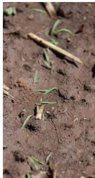
Figure 1. Teff seedlings at emergence. The crop grows somewhat slowly for the first 2 to 3 weeks as it develops a root system that will support rapid growth later.