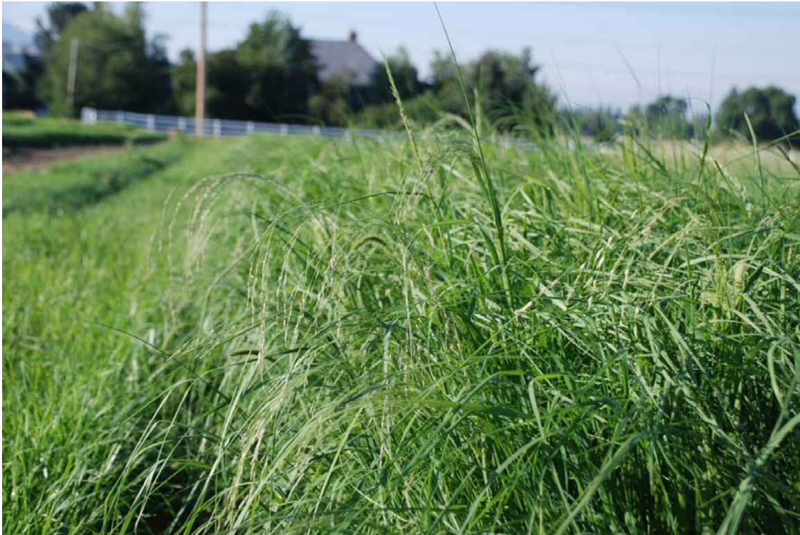
Figure 3. Teff has an open panicle type seedhead. For optimal quality, teff should be harvested as soon as seedheads begin to emerge.

Seeds should be planted shallow (less than \frac{1}{4} inch deep). Seed that is broadcast can be incorporated with a cultipacker or harrow, although often the small amount of soil movement that occurs during the first irrigation will be sufficient to cover the seed. Both coated and raw seed are available. Some growers prefer the coated seed because it is larger and easier to plant, but coated seed must be planted at higher rates to account for the weight of the coating material.