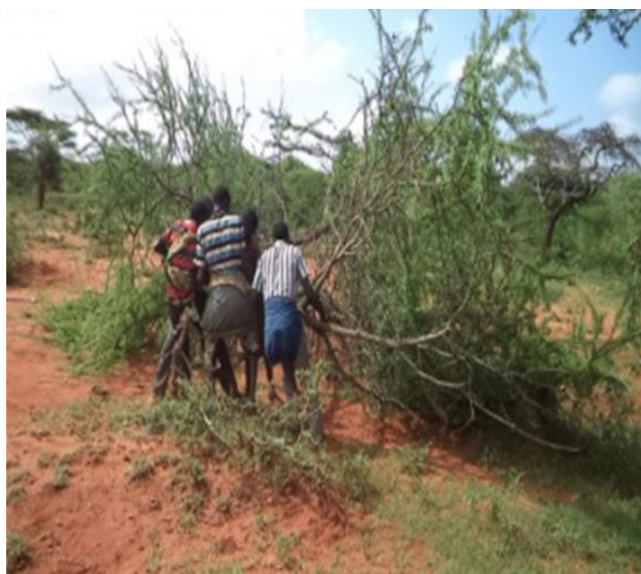
Laborers erecting a bush fence around a pond catchment in Dikale Pastoral Association.

We decided to apply the kalo concept to the pond sedimentation problem. The idea was simple: Why not protect the catchments in the immediate vicinity of ponds with bush-fencing that excludes animals from most of the area? Low-impact animal access to the water's edge could still be accommodated using bush-lined corridors. We suspected that the vegetation in the protected portions of catchments surrounding the ponds would quickly recover given that the landscape collects moisture and nutrients. More vegetation would then greatly reduce pond siltation and improve water filtration and hence water quality. The fodder inside the protected zone could be lightly used in dry