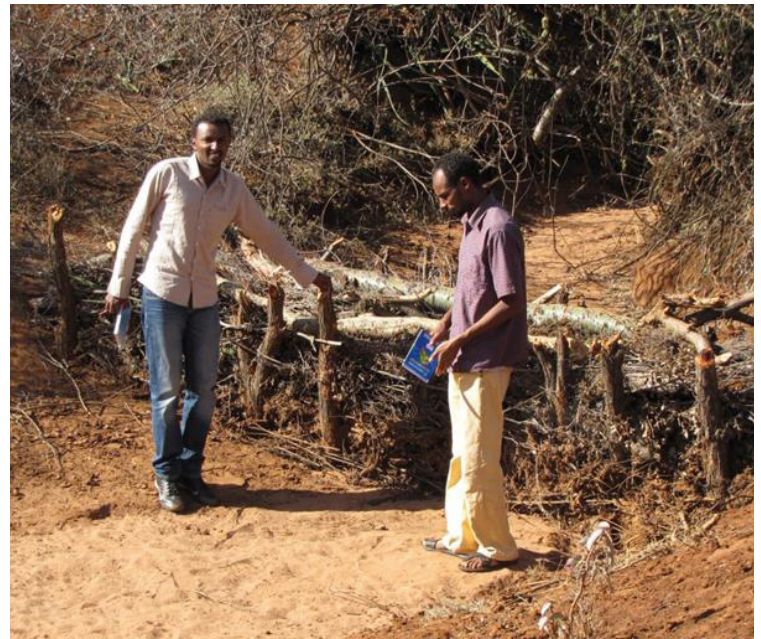
A large sieve-dam structure in a gully on the central Borana Plateau.

When we began our research project in late 2012 we were tasked with finding opportunities here to improve forage and livestock productivity. We knew this would be difficult because the plateau is overpopulated with people and has been heavily stocked with animals for decades. We decided to use participatory methods to learn what the pastoralists felt were their most important problems and go from there.