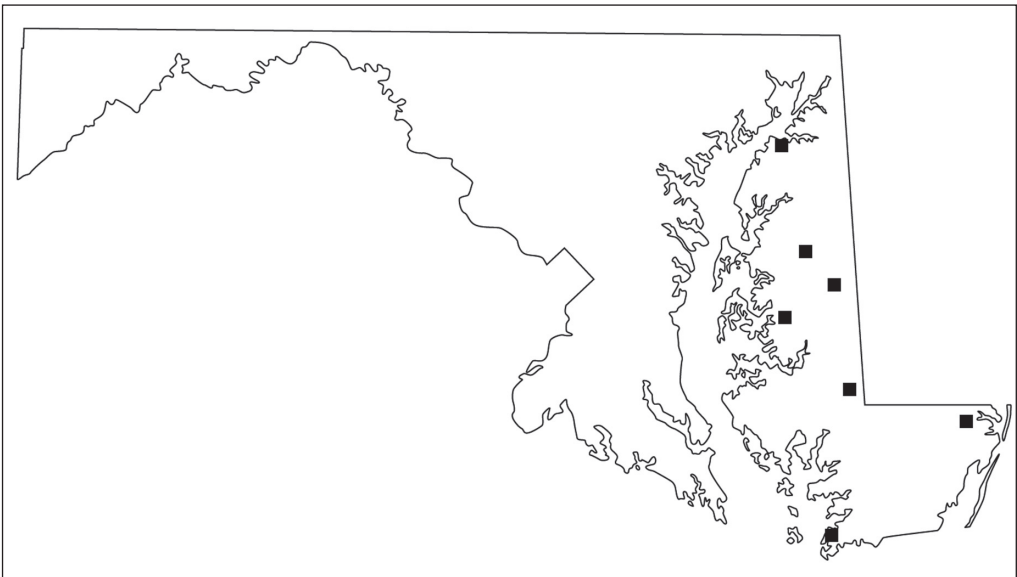
Figure 1. Location of 7 forests along Maryland's Coastal Plain region. Site locations are listed north to south in Table 1.

In order to examine dung beetle species richness and abundance, we used 200-m linear transects, with human-dung–baited pitfall traps (Larsen and Forsyth 2005), set every 50 m (5 total for each site). Human dung is among the most attractive baits to most species of coprophagous beetles (Howden and Nealis 1975) and is a readily available resource. Traps consisted of a 2.4-L (2.5-qt) plastic container (16 cm diameter, 15 cm depth) buried in the soil, flush to the rim. We hung mixed human dung, wrapped in cheesecloth and tied with biodegradable twine, from mesh chicken wire placed over the bucket. We placed a 20 cm x 20 cm plywood tile at a 45° angle above the trap to prevent rainwater flooding. We added a small amount of water and table salt to the bottom of each bucket to preserve the specimens until collection. We baited the traps once a month (May 2014–April 2015) for a 7-d period. We placed all collected beetles in 75% ethanol and returned to the lab for sorting and identification. We calculated estimated species richness (Chao1, ICE, and ACE richness metrics) in EstimateS version 9.1.0 software (Colwell 2013). We created species-accumulation curves to illustrate the rate at which new species were sampled and examined rarefaction curves to compare species richness among the 7 forests (Gotelli and Colwell 2001). We examined species diversity using the Shannon exponential mean ( e^H ) and Simpson's index ( 1/D ).