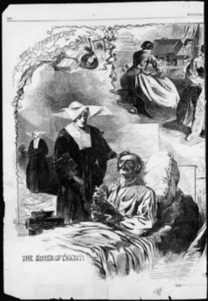
THE SISTER OF CHARITY