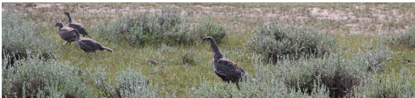
Figure 1. Sage-grouse brood in late summer.

In the 2015 decision, the FWS reemphasized the need to focus conservation efforts on protecting and enhancing priority habitats for species conservation. Many sage-grouse conservation plans have established either population or habitat management objectives within priority conservation areas. For management objectives to be valid, they must be realistic and achievable. In other words, managers must have some degree of control of the factors which most influence outcomes. If factors that influence objectives are outside the control of the manager or not within the natural variability of the systems being managed, failure and frustration is inevitable. Management objectives should also be based on the best available science and information. Thus, an understanding of sage-grouse population dynamics and how they relate to habitat characteristics (e.g., vegetation cover, scale, and fragmentation) and other environmental factors is paramount to setting effective management objectives. For example, setting objectives for the