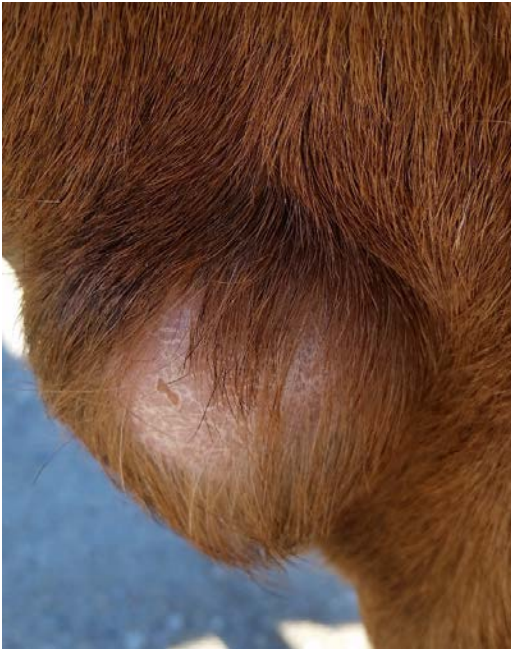
Figure 2: Abscess close to bursting under animals' left jaw near the neck. Note the loss of hair.