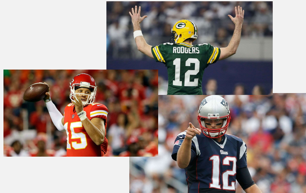
Percentage of the Salary Cap Taken by Super Bowl Winning Quarterbacks since 2000

The data was collected from online databases of NFL statics and was analyzed with the help of expert opinions in this field.