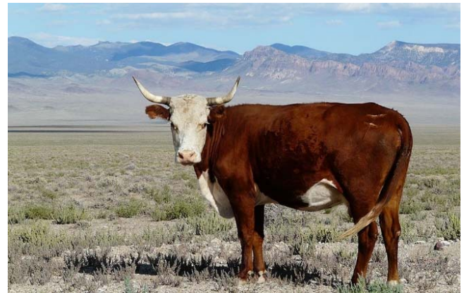
Figure 3. In the west, a large portion of beef production takes place on rangelands. 3

In the western portion of the U.S, a large portion of beef production takes place on rangeland for most of the year (Figure 3). Cattle grazing rangeland are typically consuming a diet that consists of mainly (if not entirely) roughage. Consequently, they will produce more enteric methane than cattle in feedlots that are consuming a concentrate based diet (Stackhouse-Lawson et al., 2015). This is because, in general, methane producing bacteria are not as numerous in the rumens of cattle consuming high concentrate diets so there will be less opportunity for the production of CH_4 . Additionally, the lower the quality of the feed the more CH_4 produced (Van Soest, 1994). On the other hand, lower quality feed is likely to be lower in protein. Less protein in the feed will likely result in less nitrogen that is excreted as urea in the urine.