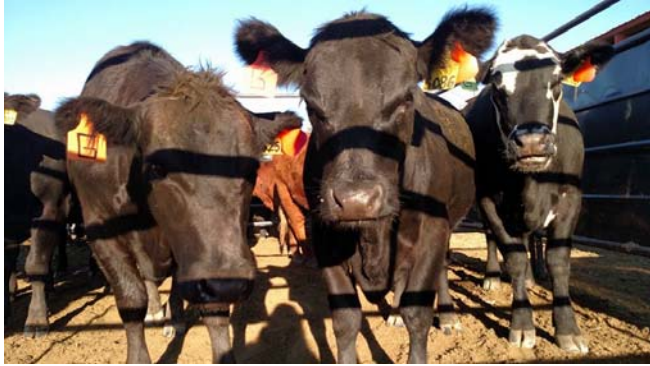
Figure 4. In the U.S. most weaned calves are finished on a high concentrate diet before being harvested.

The conventional beef production system in the United States consists of a cow-calf phase which lasts for about a year. This is followed by a finishing phase lasting for about 4 months (Figure 4).