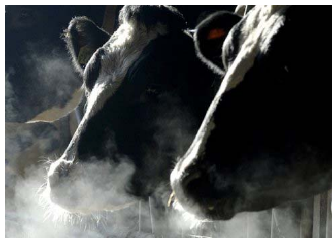
Figure 1. Most methane from cattle is the result of enteric fermentation and is expelled through their nose and mouth. 1

Total methane production from cattle comes from two main sources, manure and enteric fermentation, with enteric methane being the biggest contributor (Stackhouse-Lawson et al., 2015; Figure 1). When cattle digest their feed, it is subjected to what is called enteric fermentation in the rumen and enteric methane is a by-product of this.