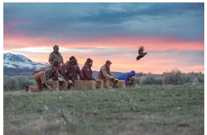
Utah Division of Wildlife and Utah State University biologists release sage-grouse at dawn on the Sheeprocks Sage-grouse Management Unit.

The first sage-grouse translocations in Utah occurred in 1976 when 48 females and their chicks were moved from Wayne County to San Juan County. Between 1987 and 1990, 43 birds were translocated by UDWR biologists from Uintah and Carbon Counties to Sevier County. In 2003, the UDWR, Brigham Young University (BYU), and the U.S Forest Service (USFS) partnered in a long-term study and translocation effort to restore the sage-grouse populations in the Strawberry Valley Sage-grouse Management Area (SGMA) located in Wasatch County in northcentral Utah. Between 2003 and 2008, these cooperators translocated 336 female sage-grouse from Diamond Mountain in the