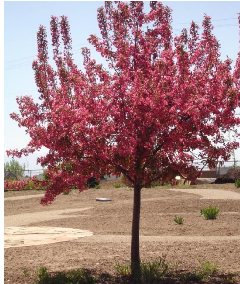
Fig. 4. Trees require little pruning as they typically establish a good canopy shape when they are relatively young, such as in the 'Radiant' crabapple pictured.

flowers are likely to be another color. Watersprouts are aggressive shoots that grow vertically in the canopy. These should also be removed annually to promote good light penetration into the canopy to support flower bud formation.