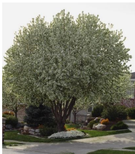
Fig. 3. Crabapples such as 'Spring Snow' are attractive in the landscape year round and require minimal irrigation.

Trees should be planted in early spring or fall when temperatures are mild. If trees are planted in the summer months, careful attention should be given to irrigation to minimize stress to the tree. Planting holes should be dug to accommodate the size of the root ball, with the hole 2 or 3 times wider than the width of the root ball (Fig. 2). Place the tree gently in the hole, being careful not to damage the roots and trunk. The tree should be planted so that the flare of the root collar is exposed and planted at or above the level of the ground. Take caution to not plant the tree too deep. If the tree is grafted, be careful not to cover the graft union with soil. Trees that are planted too deep will struggle to survive and may grow suckers at the base more readily. Backfill the hole with soil and immediately water the tree. Trees should be placed with the mature tree size in mind.