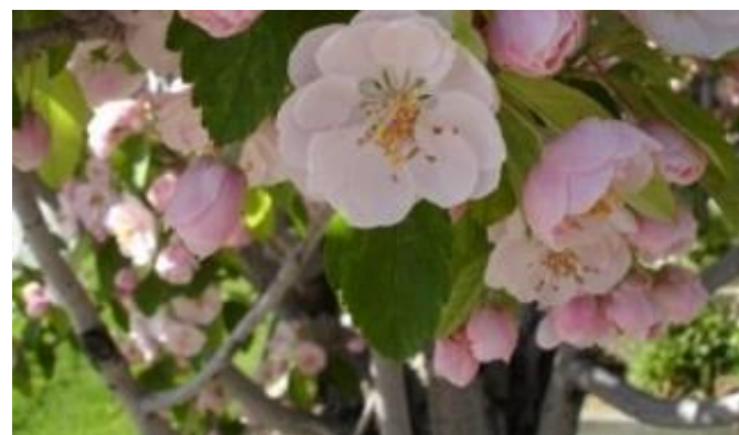
Fig. 1. The double blooms of Klems Betchel provide a delicate and beautiful focal point in the spring garden.

Crabapples ( Malus sp. ) are native to Kazakhstan and North America. Crabapples are ornamentals that are closely related to common apple trees and are distinguished by fruit size. Technically, any apple fruit that is smaller than 2-inches is considered to be a crabapple. There are approximately 1,000 different varieties of crabapples, with about 100 of these being commonly planted. Crabapples are an excellent addition to Utah landscapes as they are considered to be drought tolerant, low maintenance, and versatile trees. They withstand low winter temperatures and the hot dry conditions common in Utah summers. Trees come in many shapes and sizes. Mature tree size can vary from small (10' high x 10' wide) to medium (25' high x 25' wide). Tree shape can range from upright, columnar, rounded, semi-weeping, or spreading.