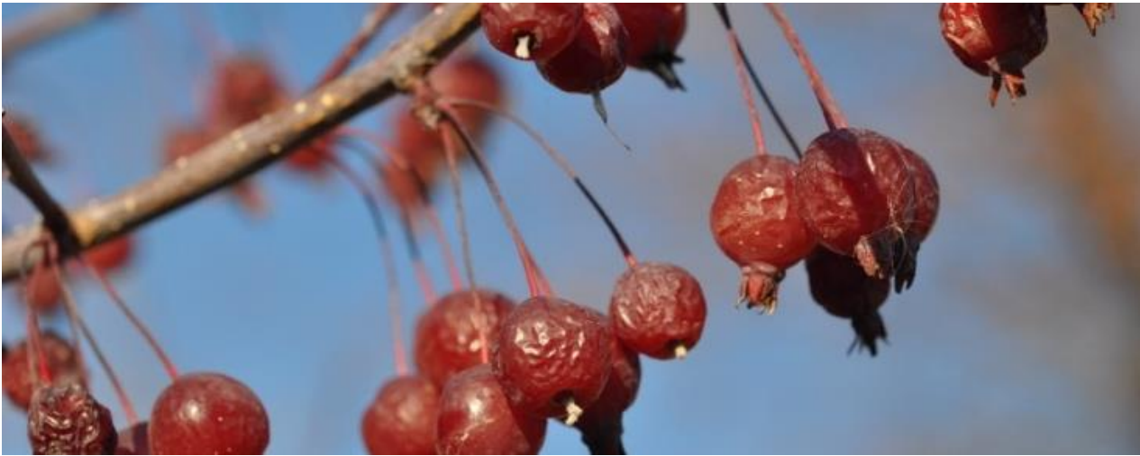
Fig. 6. Persistent fruit on crab apples is attractive and provides a food source for birds during winter months.