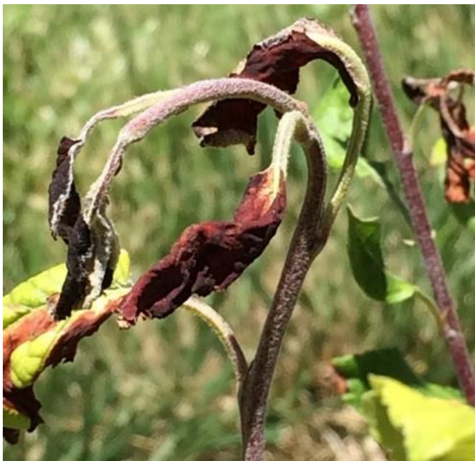
Fig. 5. Fire blight is a common and devastating bacterial disease that affects apples. Shepherd's crooking at the tips of shoots, blackened leaves, and amber ooze are symptoms of Fire blight.