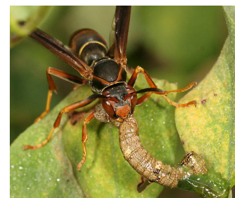
Fig. 21. Northern Paper Wasp