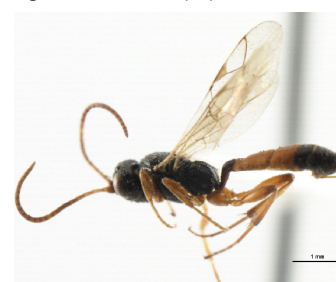
Fig. 27. Diadromus subtilicornis