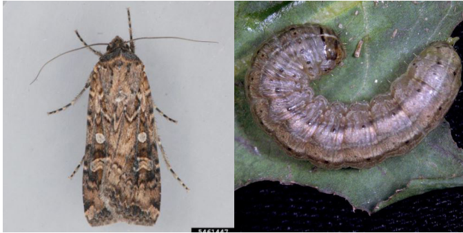
Fig. 8. Army Cutworm ( Euxoa auxiliaris )