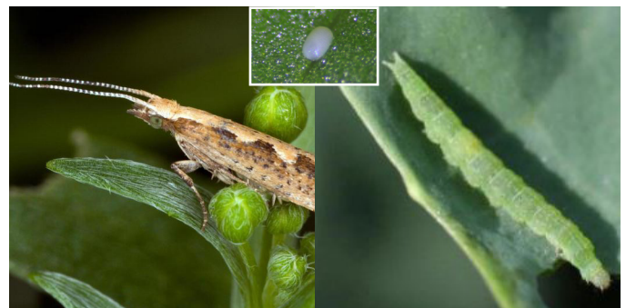
Fig. 6. Diamondback Moth ( Plutella xylostella )