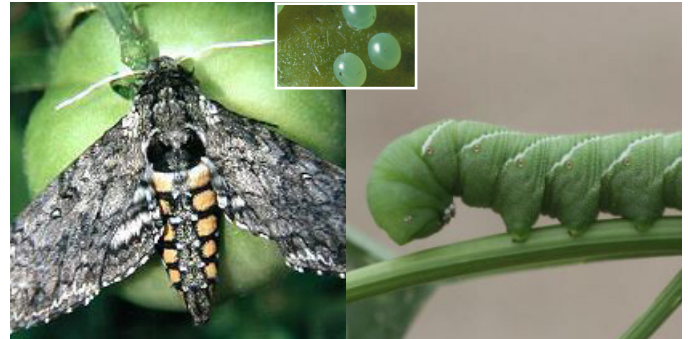
Fig. 3. Tobacco Hornworm ( Manduca sexta )