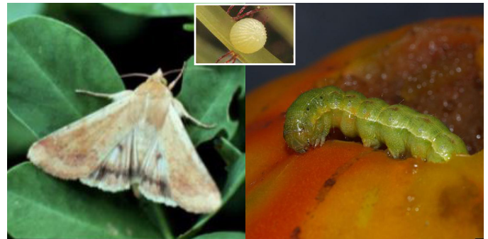
Fig. 4. Tomato Fruitworm ( Helicoverpa zea )