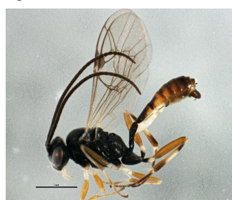
Fig. 26. Diadegma insulare