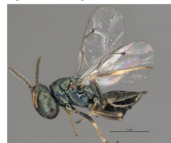
Fig. 25. Pteromalus puparum