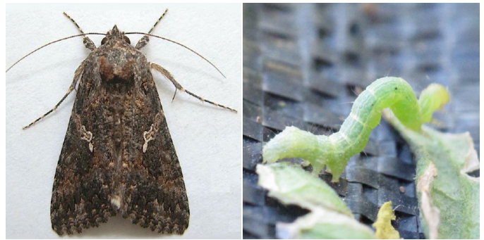
Fig. 7. Cabbage Looper ( Trichoplusia ni )

Adult armyworm moths are typically mottled grey and brown with light-colored markings. Wingspan among the various species ranges from 25-40 mm long. The larvae have a large range of colors from tan to green to almost black (Figs. 13-15).