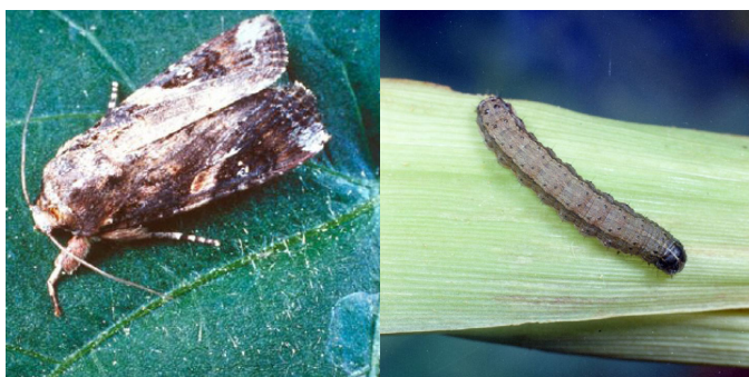
Fig. 14. Fall Armyworm ( Spodoptera frugiperda )