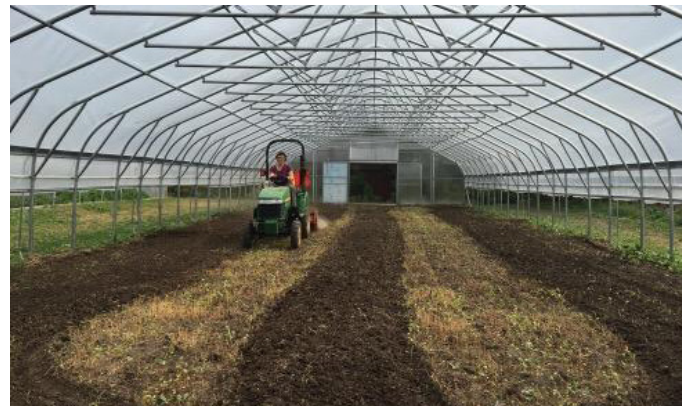
Fig. 18. Tilling soil in the high tunnel can destroy overwinter pupae stages of various caterpillar pests.