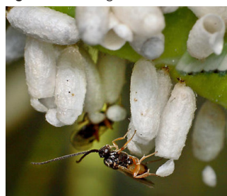
Fig. 22. Cotesia congregata