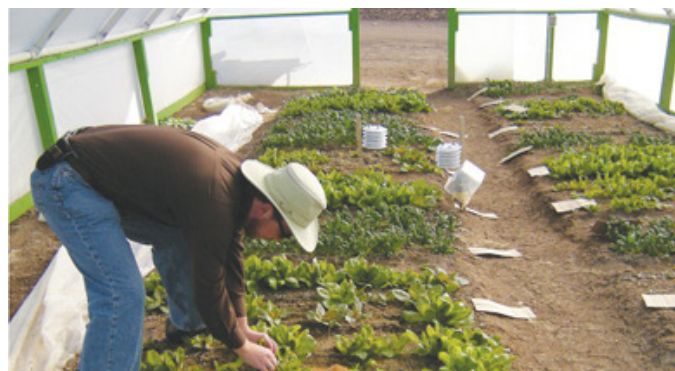
Fig. 16. Monitor for signs and symptoms of caterpillar pests regularly inside of high tunnels.

Traps are a good way to indicate when adult moths or butterflies have arrived in an area and can indicate their relative numbers. If you find injured plants, dig about 1-inch deep around the base of plants to check for live cutworms.