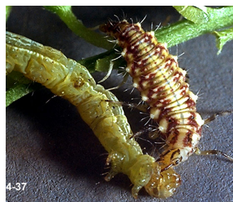
Fig. 20. Lacewing Larvae

Many predators, parasites, and diseases attack armyworms and cutworms , but because armyworms and cutworms dwell beneath the soil surface, few of these natural enemies are effective in controlling their populations. Bacillus thuringiensis (Bt) products can effectively control young armyworm and cutworm larvae.