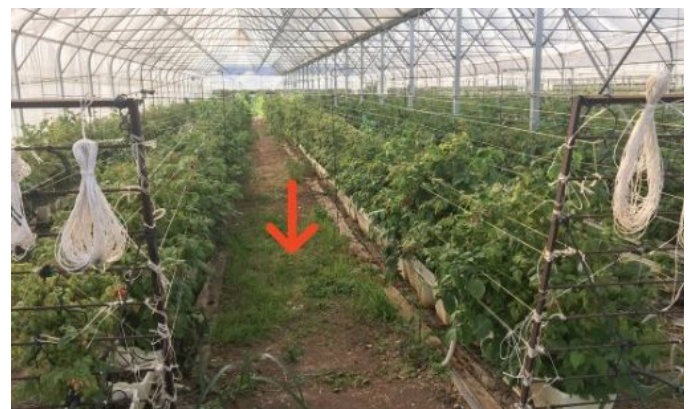
Fig. 19. High tunnel with weeds growing in pathways.