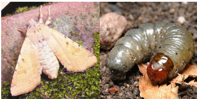
Fig. 10. Glossy Cutworm ( Crymodes devastator )