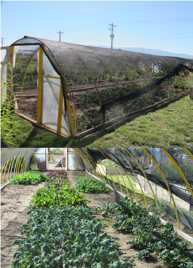
Fig. 16. Insect netting or shade cloth is a physical exclusion method that can be placed on high tunnels during the warm months to prevent moths and butterfly species from entering the structure.