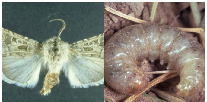
Fig. 11. Western Pale Cutworm ( Agrotis orthogonia )