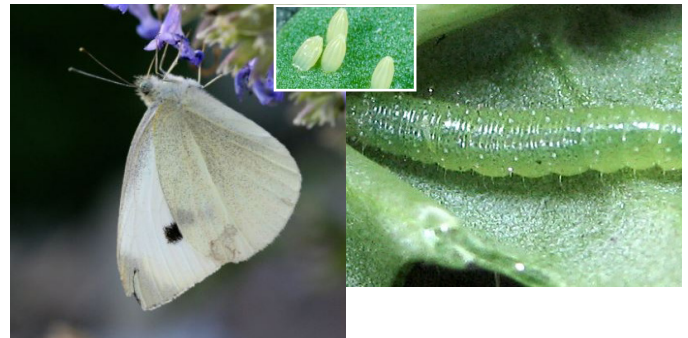
Fig. 5. Imported Cabbage Worm ( Pieris rapae )