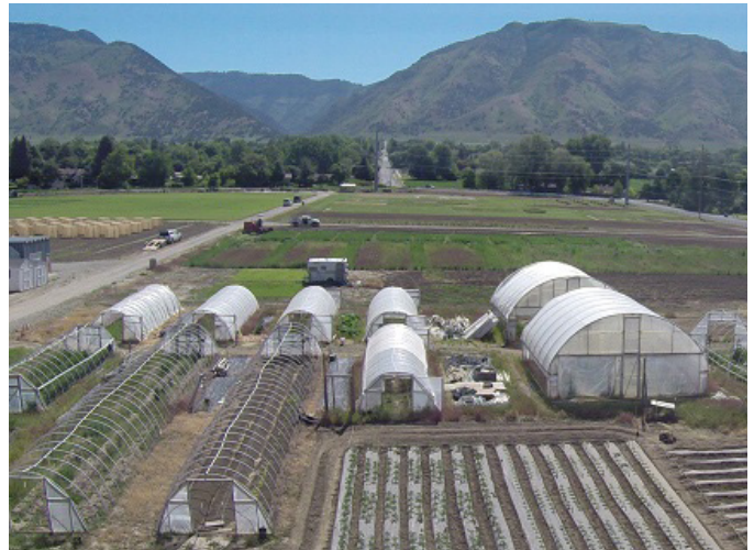
Fig. 1. High tunnels used for vegetable production in Utah.

Caterpillar pests in several insect families can affect many high tunnel crops along with many weeds: