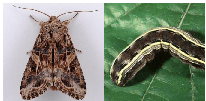
Fig. 15. Western Yellowstriped Armyworm ( Spodoptera praefica )