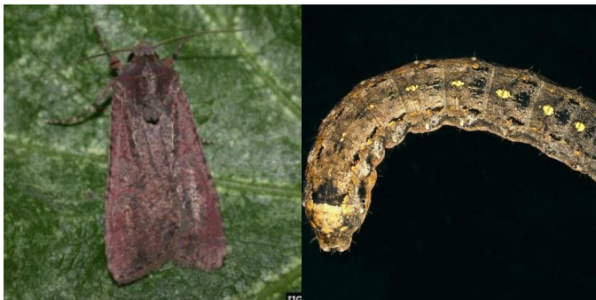
Fig. 12. Variegated Cutworm ( Peridroma saucia )