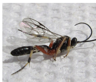
Fig. 30. Hyposoter exiguae