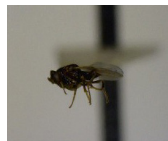
Fig. 29. Copidosoma truncatellum