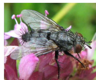
Fig. 31. Voria ruralis