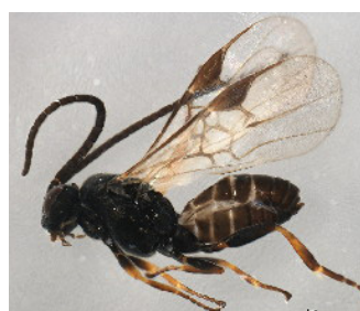
Fig. 28. Microplitis plutellae