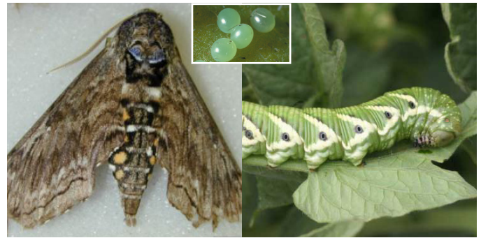
Fig. 2. Tomato Hornworm ( Manduca quinquemaculata )

Cabbage looper (Fig. 7) eggs are dome-shaped and light yellow. Larvae develop through 5 instars. Smooth and pale to dark green, they are thin with white or light-yellow stripes and tapered at the head. The pupa is a fuzzy cocoon of 3 cm. Adult moths are greyish-brown with eight silver marks and a wingspan of 4 cm.