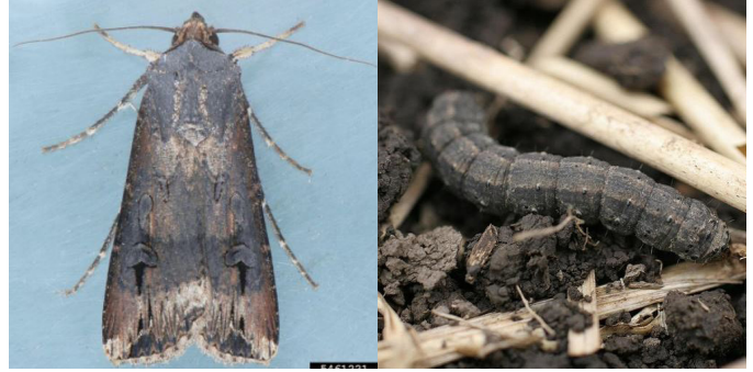
Fig. 9. Black Cutworm ( Agotis ipsilon )