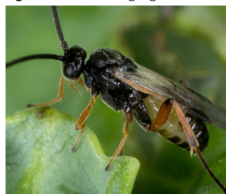
Fig. 24. Cotesia rubecula