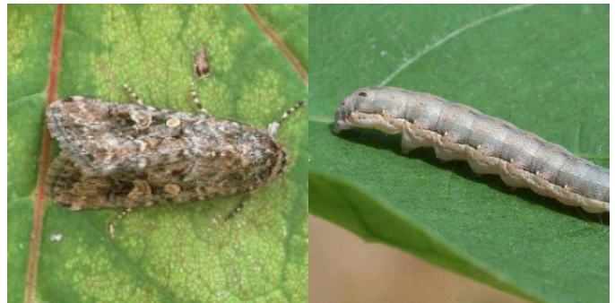
Fig. 13. Beet Armyworm ( Spodoptera exigua )