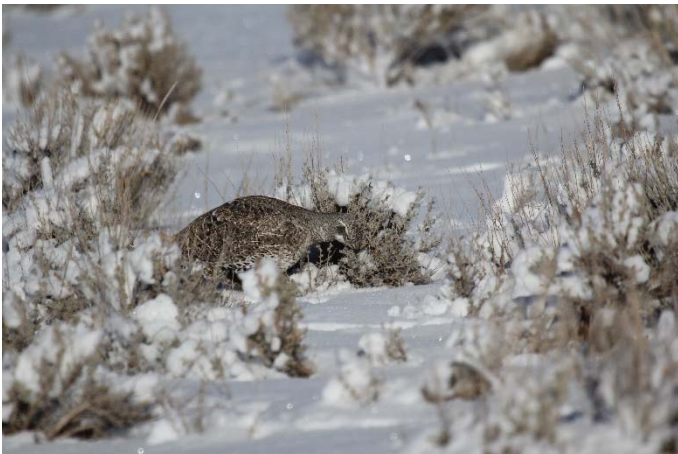
Sage-grouse female eating black sagebrush (A. nova) during the winter.

Greater sage-grouse ( Centrocercus urophasianus ; sage-grouse), as their name implies, depend on sagebrush ( Artemisia spp.) for their survival. In fact, during the winter sage-grouse survive by only eating sagebrush.