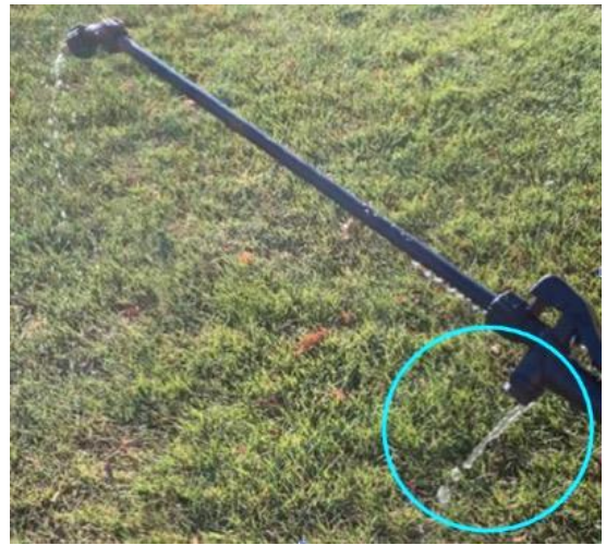
Figure 2. Winter storage damaged this spray gun. Proper winterization saves time and money.