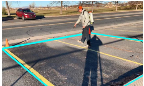
Figure 3. The blue lines mark the boundary of an 18.5 ft by 18.5 ft square. Parking spaces are useful for squaring the corners of the spray area.