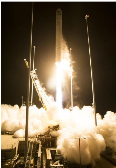
Figure 4: Launch of MYSat-1 Onboard the Antares NG-10 Mission to the ISS

Coursework and research are important, especially in a university setting. But it is the hands-on experience of building a satellite that allows students to excel after