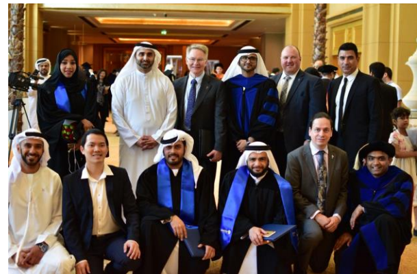
Figure 1: Members of the Graduating Class of 2017 with Executives from Yahsat and Northrop Grumman

Figure 1 shows some members of the first graduation class shortly after receiving their degrees in May of 2017, less than two years after the program was officially launched. They are joined by executive leadership from Yahsat and Northrop Grumman; such executive support was key to the establishment of the program.