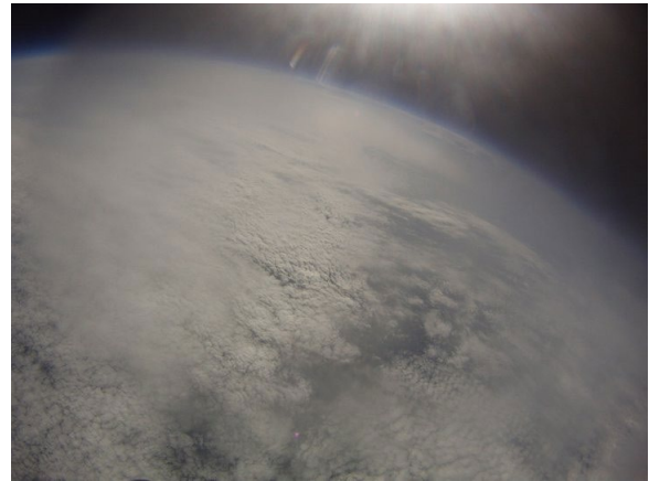
Figure 5: Earth from Balloon Satellite (15)

education and research at the academy and this is complementary to its goals," (15)