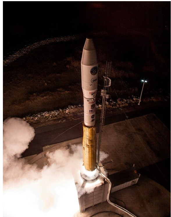
Figure 3: ORS-3 Liftoff from Wallops (12)

Spaceport. The Minotaur reached orbit with no issues and deployed its primary payload, the Space Test Program Satellite (STPSat)-3, before ejecting its 28 auxiliary payloads from NASA's Nanosatellite Launch Adapter System (NLAS). (12) That included West Point's first student built satellite.