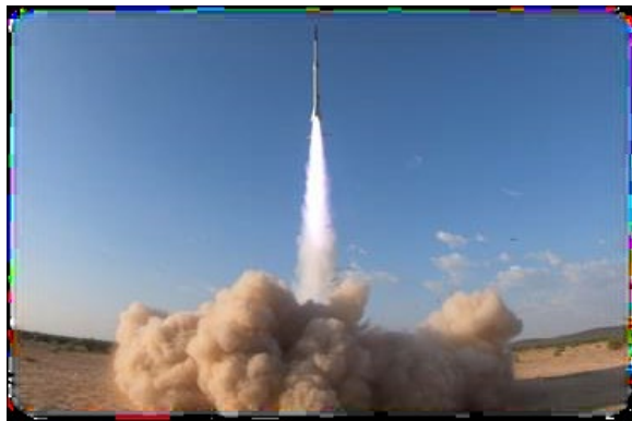
Figure 4: 2 Stage Sounding Rocket Launch, 2019 SPACE PROFESSIONAL DEVELOPMENT

The goals have grown, and the path is being set for the cadets to try to go it on their own. They have broken out into several interdisciplinary teams tackling pieces of the overall effort. Some are working the rocket structure and separation design while others are working with boron – potassium nitrate (BPN) for ignitors. In concert with that work, other teams are designing and fabricating launch rails. Most recently, due to the delays caused by the COVID-19 outbreak some of the focus has shifted from launch to building a fully instrumented static fire test stand. There are plenty of projects and opportunities for cadet led research and they are excited about the potential for their research to help solve real Army problems.