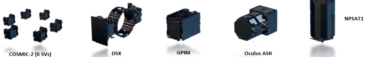
Figure 2: Co-prime and auxiliary payloads on STP-2

flight hardware, delivery of spacecraft to three different orbits, and additional flight data for future launches were all objectives. SMC had similar objectives to SpaceX. STP desired successful launch of the six COSMIC-2 spacecraft, the single DSX spacecraft, the five ESPA-class spacecraft, and 24U of CubeSats without spacecraft harming each other or the launch, so each spacecraft would have the opportunity to demonstrate technology, provide desired data, and advance relevant knowledge. In addition, fourteen of the experiments on board were selected through the DoD Space Experiments Review Board (SERB); access to space for SERB experiments is STP's primary mission. COSMIC-2 and DSX were designated the co-primes of the STP-2 mission by virtue of their driving orbit requirements, with secondary priority given to the ESPA-class spacecraft, and tertiary priority given to the CubeSats.