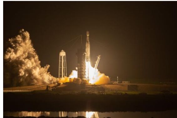
Figure 6: STP-2 launch

STP-2 was a multi-nation, multi-agency, multi-organization rideshare effort that served as a pathfinder for how government, industry, academia, and international partners can work together on multi-manifest missions. It is the team’s hope that by applying some of the lessons learned reflected in this document – by establishing good communications and mutual understanding up front, by implementing strong rideshare management techniques and interface control, by understanding policy compliance and do-no-harm considerations, and by facilitating knowledge transfer within and among payload teams – other missions can achieve the success STP experienced on its first Falcon Heavy mission.