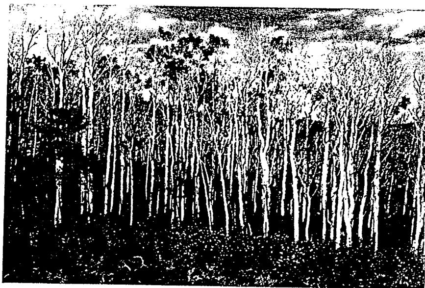
Figure 3.—Abundant regeneration of aspen 3 years after herbicide spraying.