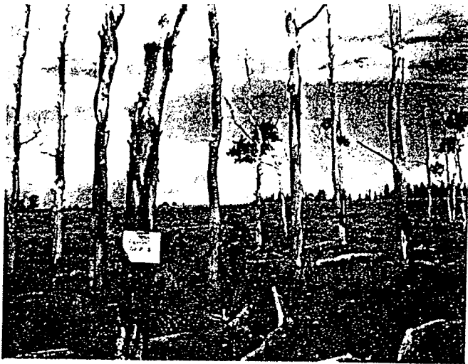
Figure 4.—Isolated aspen stand treated with herbicide with no regeneration of aspen because of heavy grazing by deer and cattle.

(less than 1 acre [0.4 ha]), isolated, and grazed heavily by livestock or big game (fig. 4).