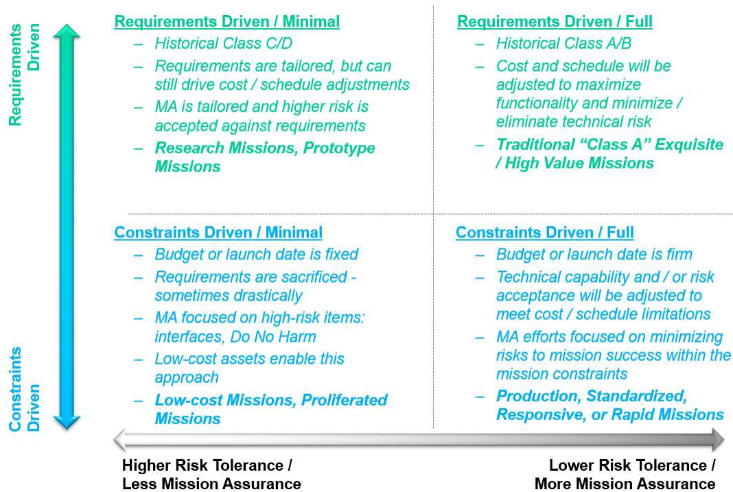
Figure 1: Constraints and Requirements-Driven Mission Assurance Spectrum

interface, they must allow developers the freedom to trade functionality or performance requirements if needed to fit that standard.